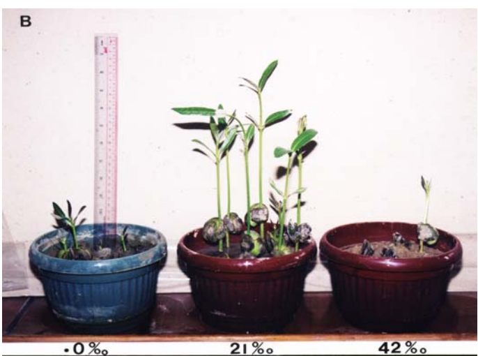
Figure 1: (A) Indoor growth of Avicennia marina, (B) A. marina plants growing at 0, 21, 42 % salinities.

The shape of the leaf blade was constant among the three salinity treatments: all leaves had narrowly oblong blades, with parallel and entire margins. The length to breadth ratio was 4:1in both saline treatments, but only 3.5:1 for the tap-water treatment. Leaves are generally green on the upper surface and gray beneath with an obtuse base and short petioles (about 1 cm). Two leaves are usually produced at each node. Leaves are decussately arranged along the stem. Leaf morphology was investigated through determination of four parameters including length and width of blade, length of petiole and leaf size (Table 1). The highest mean values for many of these variables was recorded for 21 ‰ salinity treatment, and these differences were usually statistically significant.