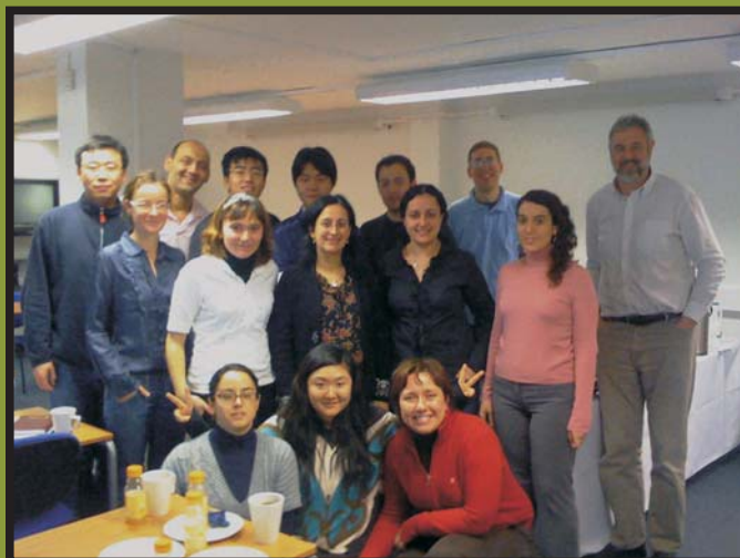
Research group at CICCS