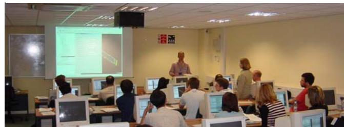
June 2005 Summer School Practical Session

The course builds on the experience gained at the University of Nottingham with its Applied CFD course, on last year's successful EPSRC Summer School in Industrial CFD and the CFD@Nottingham Seminar and Lecture Series. The University of Nottingham's breadth of researchers, with track records in theory and applications, makes the proposed course particularly strong.