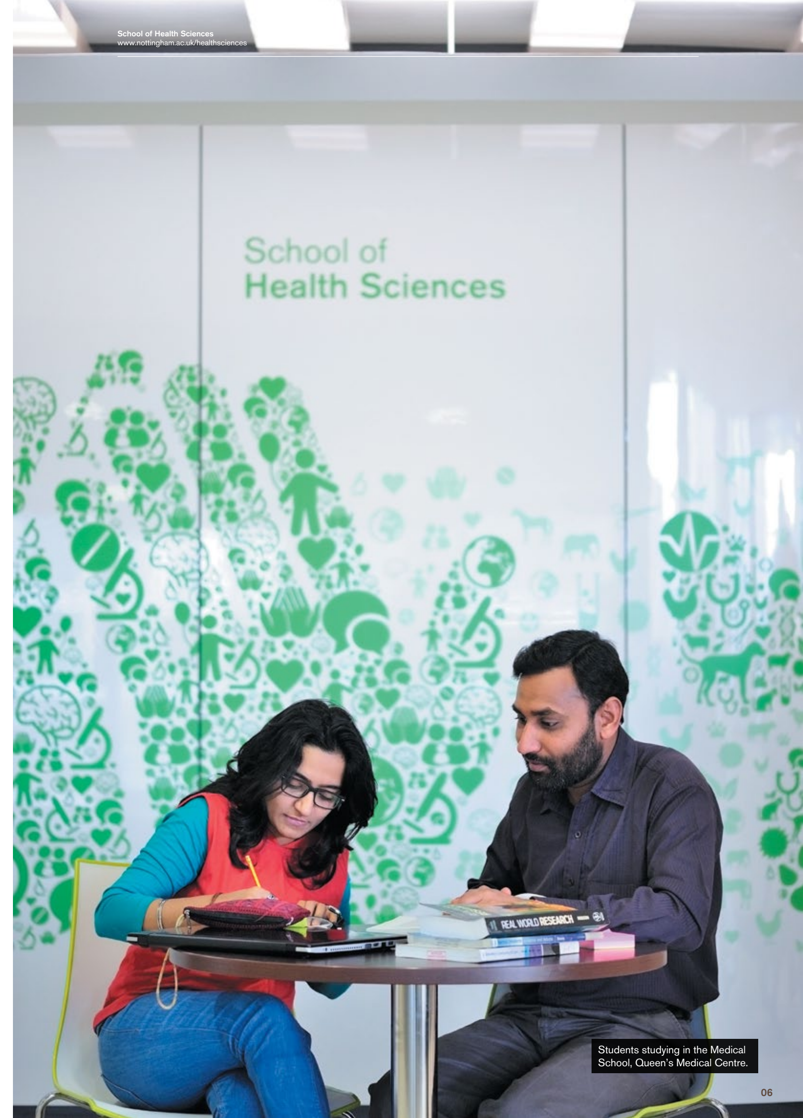
Students studying in the Medical School, Queen's Medical Centre.

For further information about the School of Health Sciences, please see our website at www.nottingham.ac.uk/healthsciences