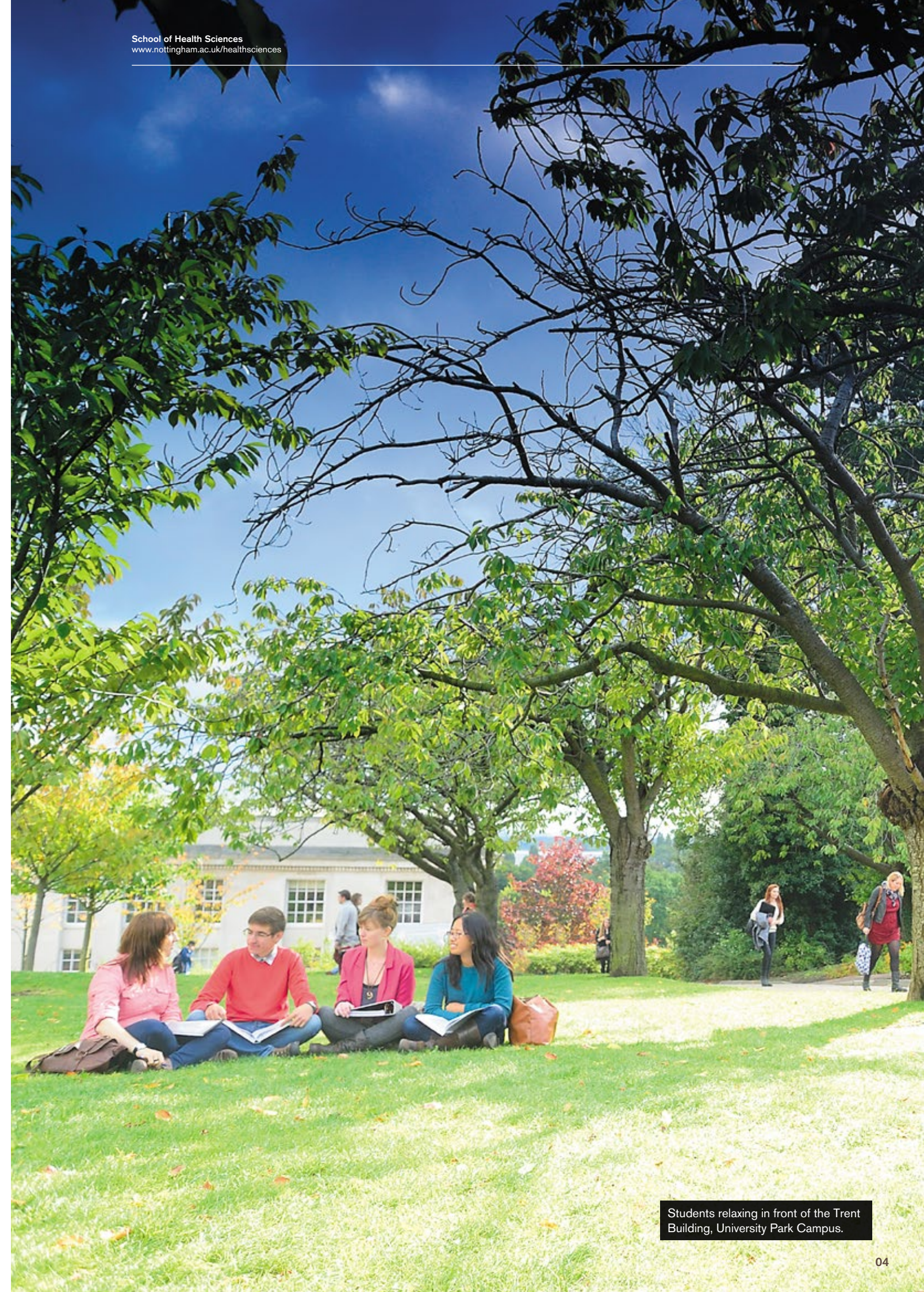
Students relaxing in front of the Trent Building, University Park Campus.

The University of Nottingham is placed 77th in the world and in the top 1% of universities internationally by the latest (2014) QS World University Rankings.