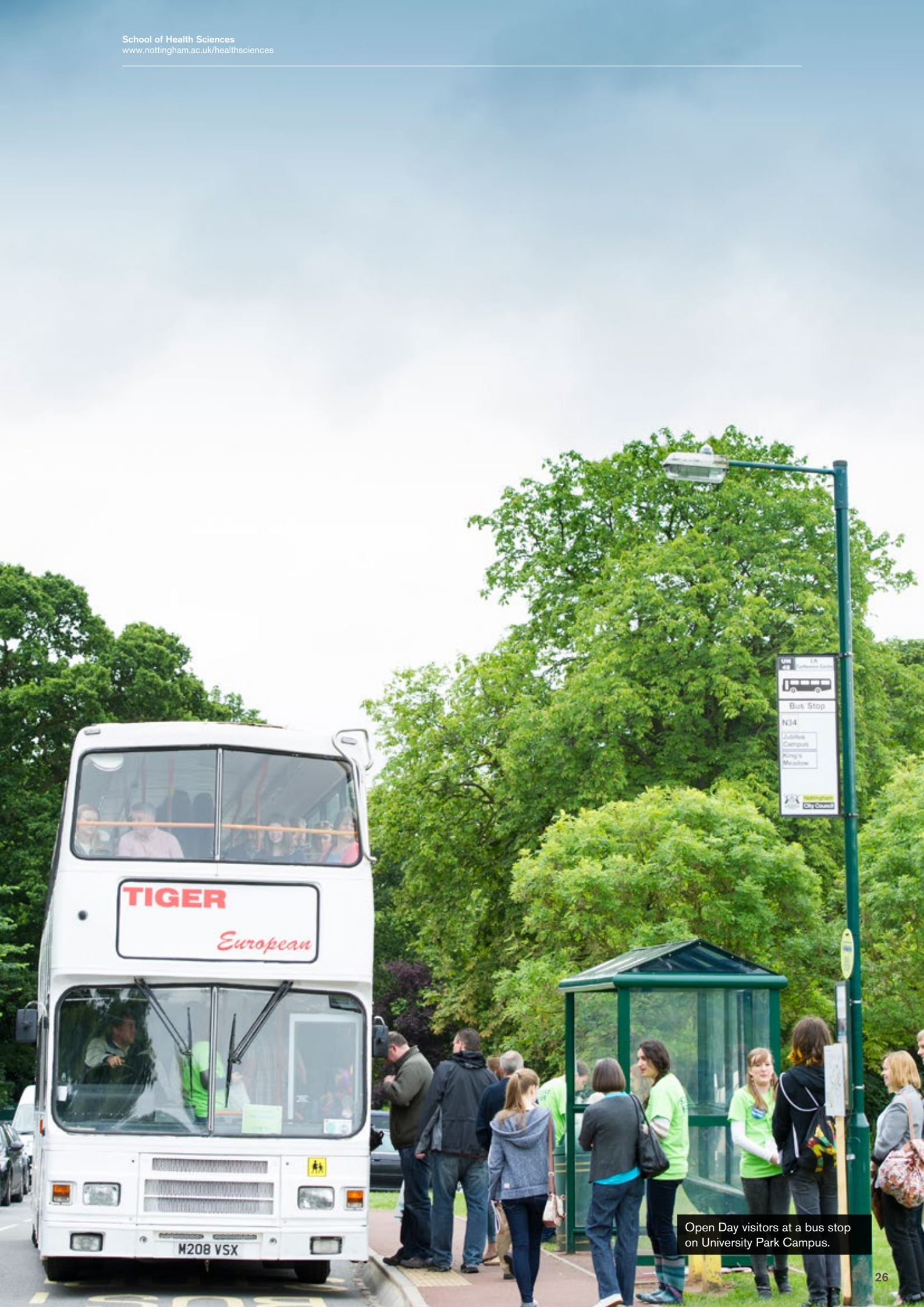
Open Day visitors at a bus stop on University Park Campus.