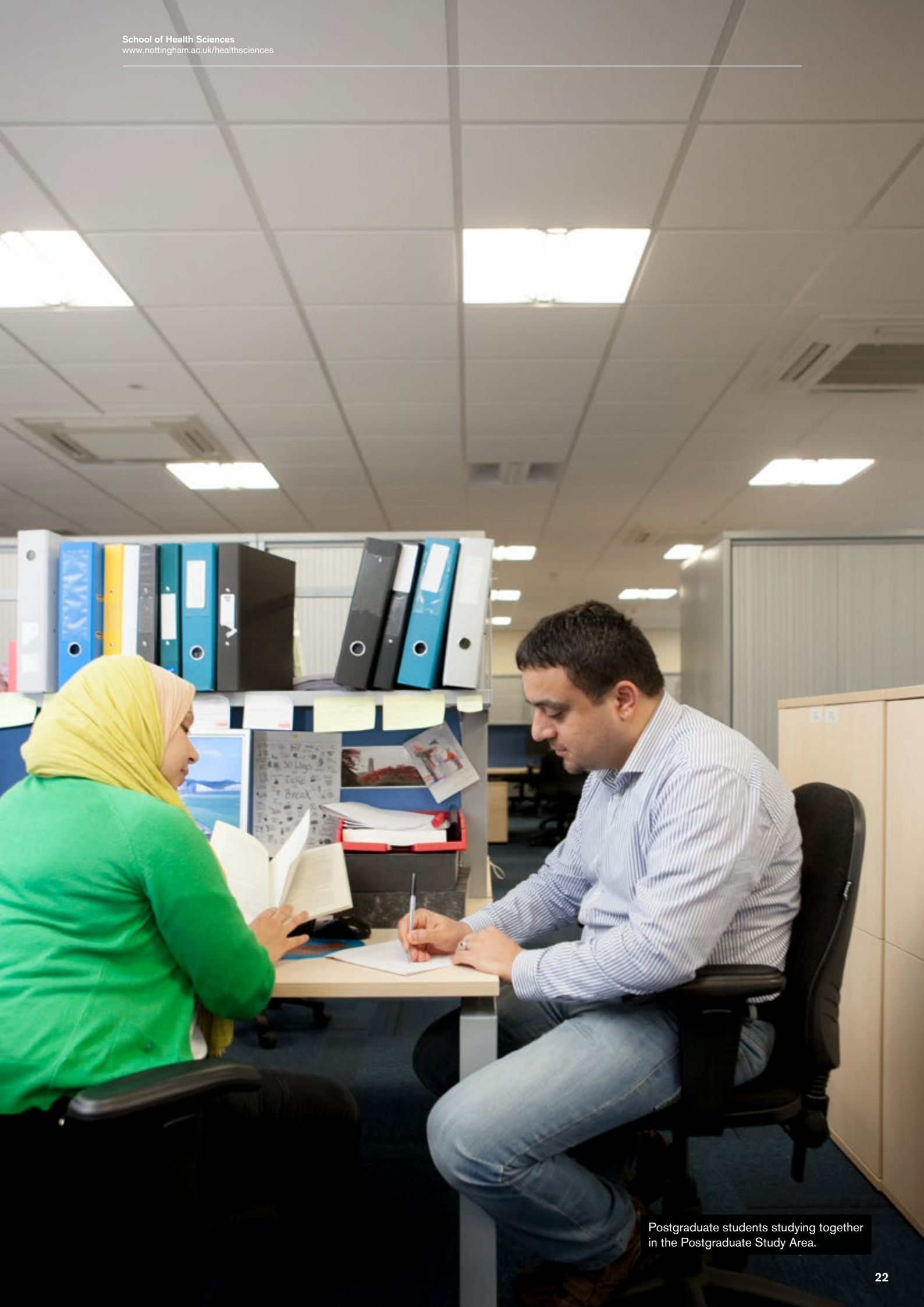
Postgraduate students studying together in the Postgraduate Study Area.