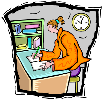
Your room (study / bedroom)