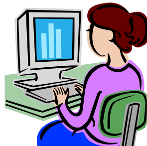
Computer room at University