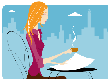
Elsewhere (e.g. café)

What are the benefits of the location e.g. accessibility to materials (lecture notes, books), 24-hour access (opening hours)?