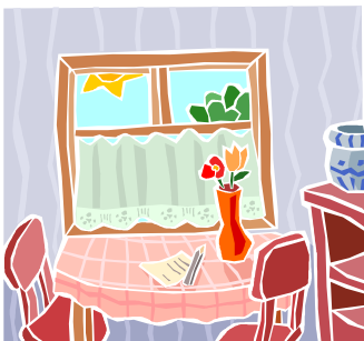
Another room in the house (kitchen / living room table)