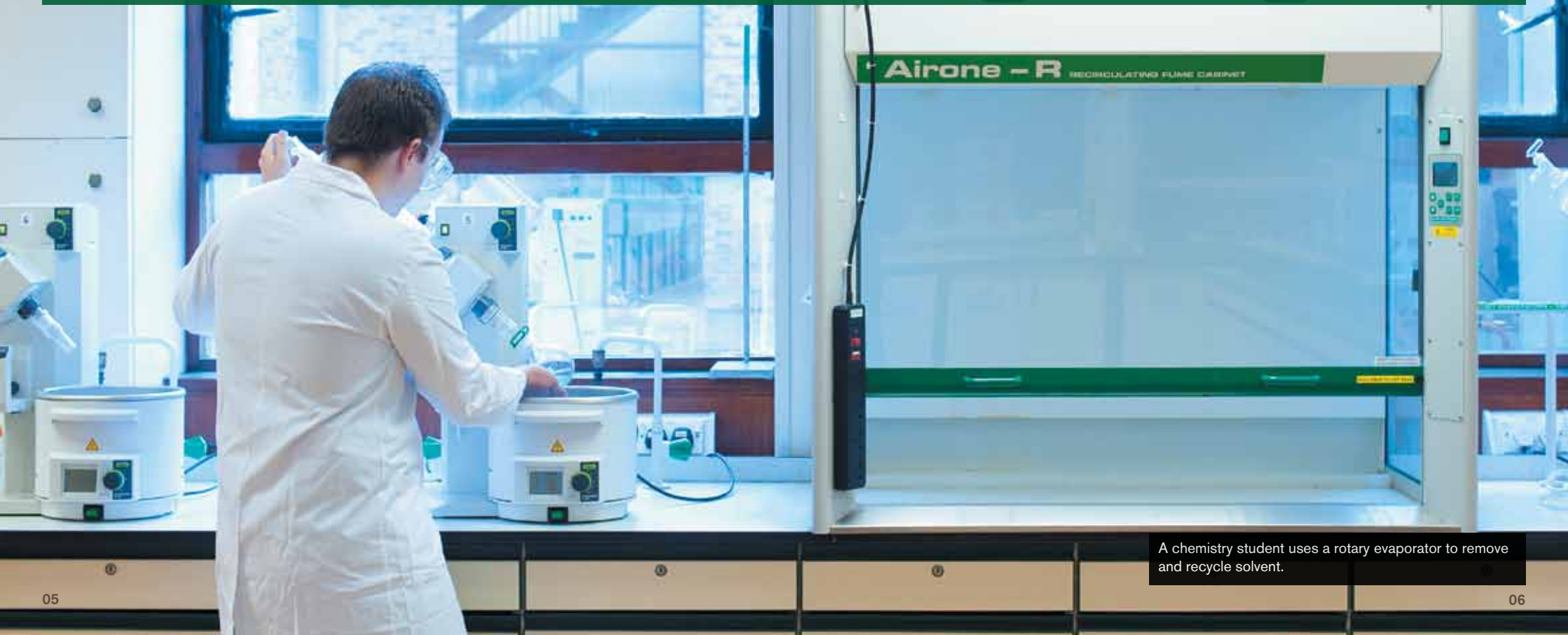
A chemistry student uses a rotary evaporator to remove and recycle solvent.

You can read more about our students' and researchers' achievements by visiting our news pages: www.nottingham.ac.uk/chemistry