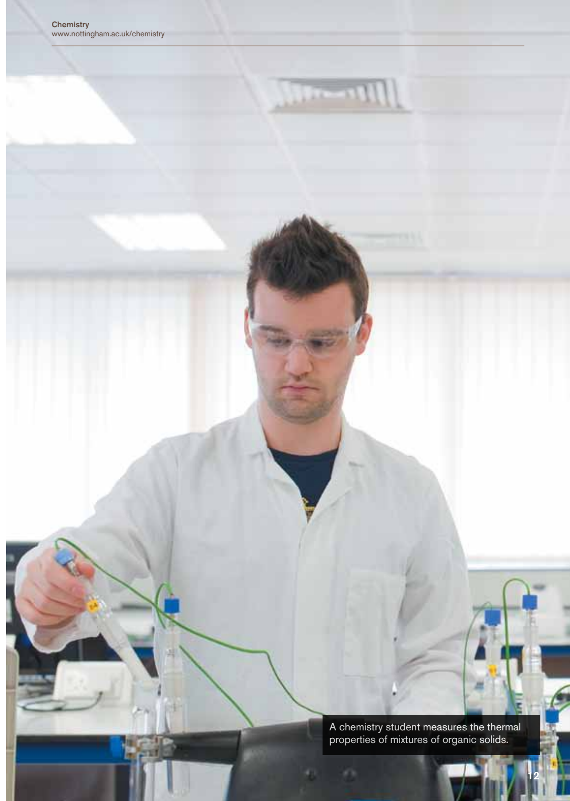
A chemistry student measures the thermal properties of mixtures of organic solids.

The final year of the MSci course provides the opportunity for increased specialisation. Advanced theory modules are provided together with a number of specialist modules which reflect the research interests of staff. Each student will undertake a major research project. This provides an opportunity to experience research methods employed in modern chemistry. Project topics range from biological chemistry through materials chemistry to surface science and on to laser chemistry and computational chemistry. For example, you may be involved in a group which is synthesising pharmaceuticals or using supercritical fluids to improve reaction yields. The project will develop not only your practical ability and problem-solving skills, but also your appreciation of the published literature and your use of library and computer database resources.