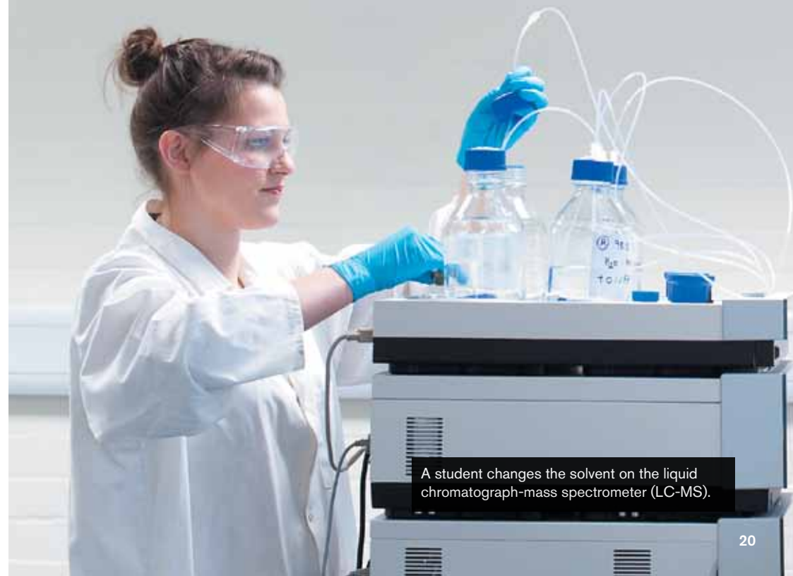
A student changes the solvent on the liquid chromatograph-mass spectrometer (LC-MS).

MSci Medicinal and Biological Chemistry with an Assessed Year in Industry (fourth year)