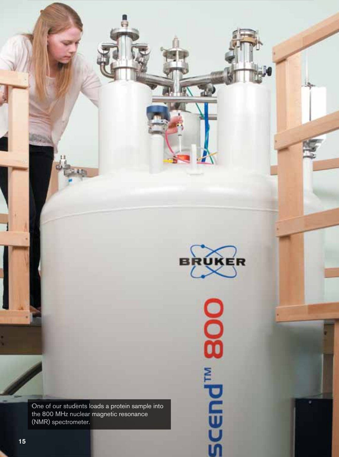
One of our students loads a protein sample into the 800 MHz nuclear magnetic resonance (NMR) spectrometer.