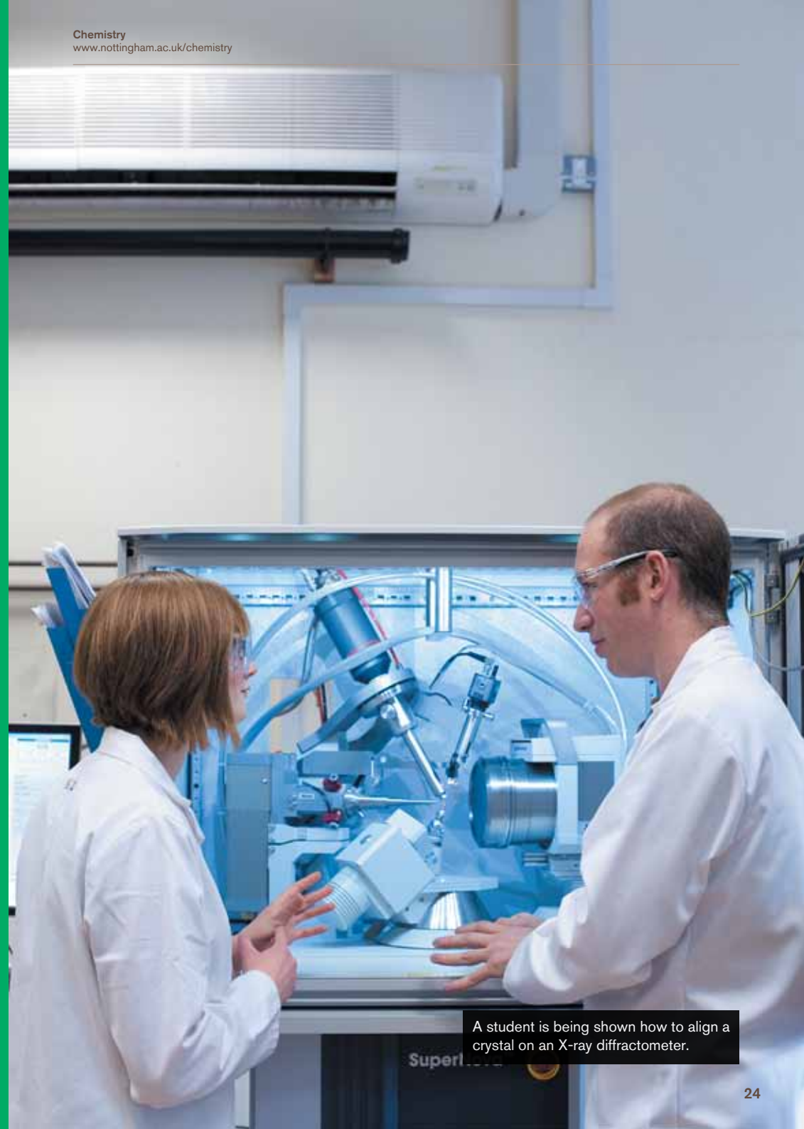
A student is being shown how to align a crystal on an X-ray diffractometer.

* For details of the deadline, please see www.nottingham.ac.uk/accommodation