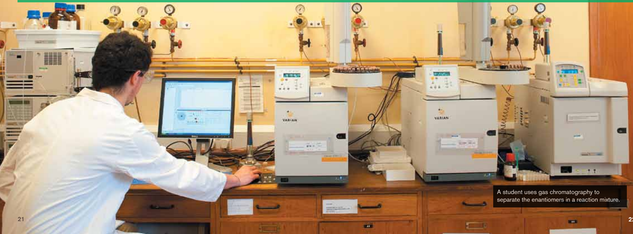
A student uses gas chromatography to separate the enantiomers in a reaction mixture.

The Careers and Employability Service on campus offers an extensive range of careers services, including CV-writing sessions, interview advice, presentations by major employers and general careers advice.