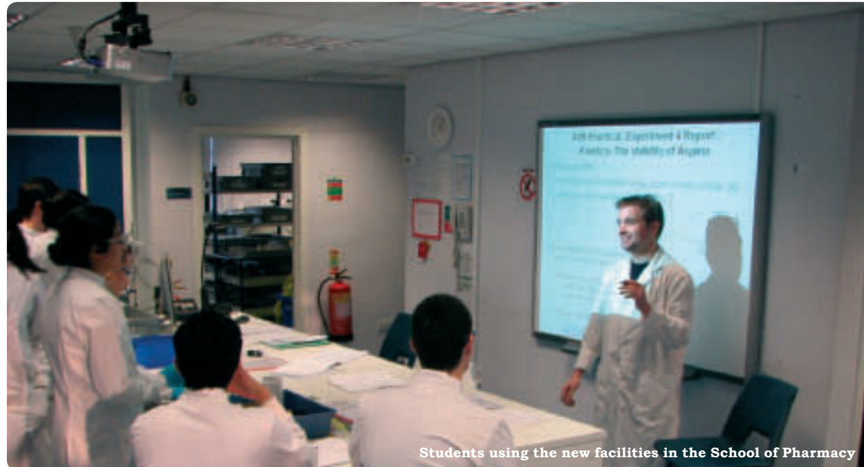
Students using the new facilities in the School of Pharmacy