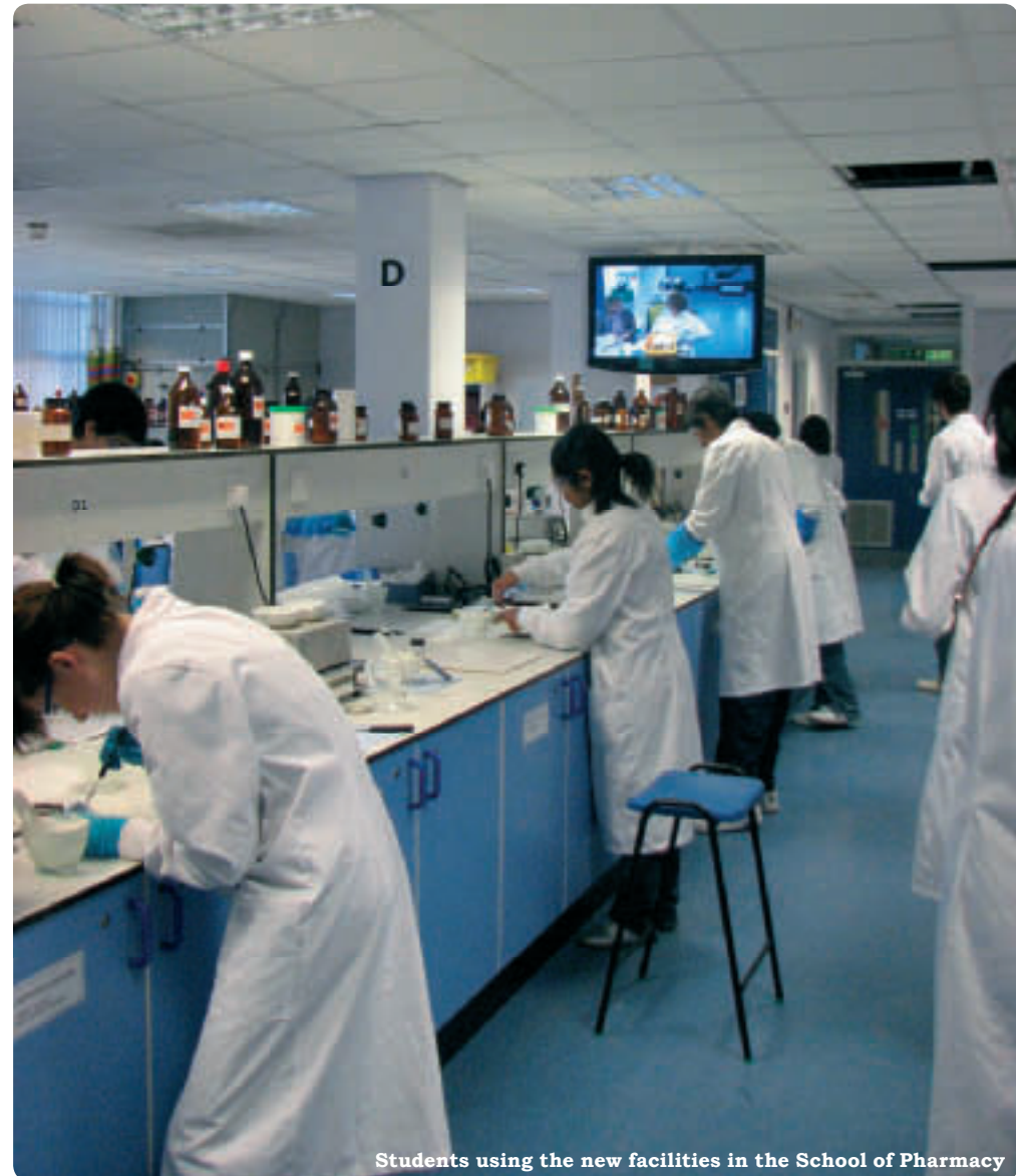
Students using the new facilities in the School of Pharmacy

The systems are used as an adjunct to teaching, and provide a rich method for recording group discussions that can be referred to beyond the end of the session whilst also providing a permanent record. These records have been used to shape future years' sessions when multiple sessions have been run concurrently, a phenomenon not previously possible with conventional whiteboards.