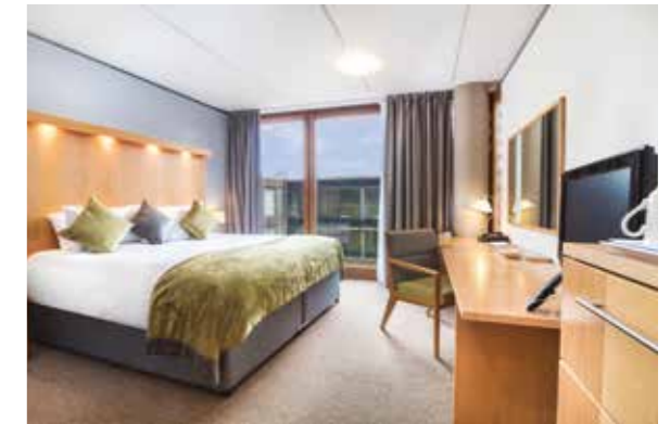
The Jubilee Hotel and Conferences Centre Double Hotel Room