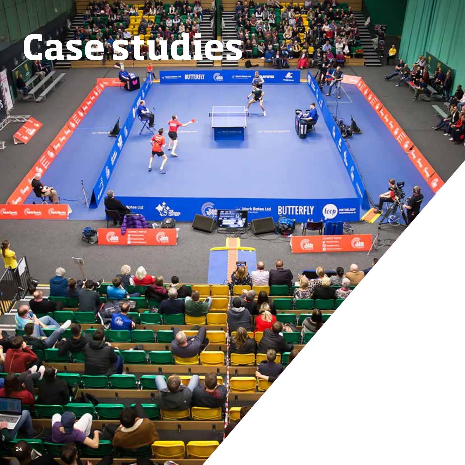
Table Tennis England Hosting events

University of Nottingham acts as a hub for English performance table tennis, with David Ross Sports Village hosting the England national training squad and national competitions.