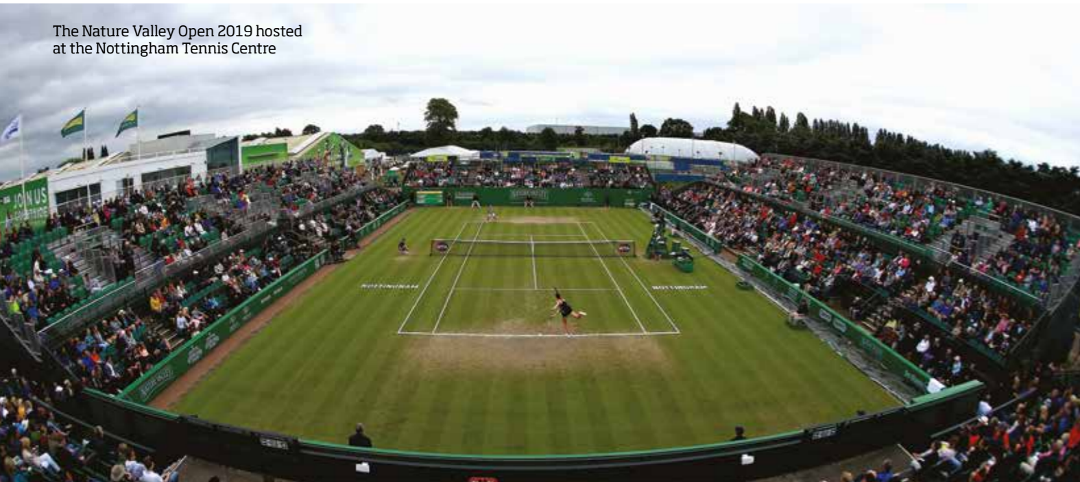
The Nature Valley Open 2019 hosted at the Nottingham Tennis Centre