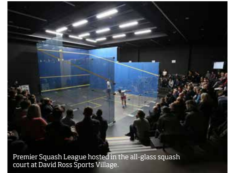
Premier Squash League hosted in the all-glass squash court at David Ross Sports Village.

Built in cameras for live streaming and performance analysis