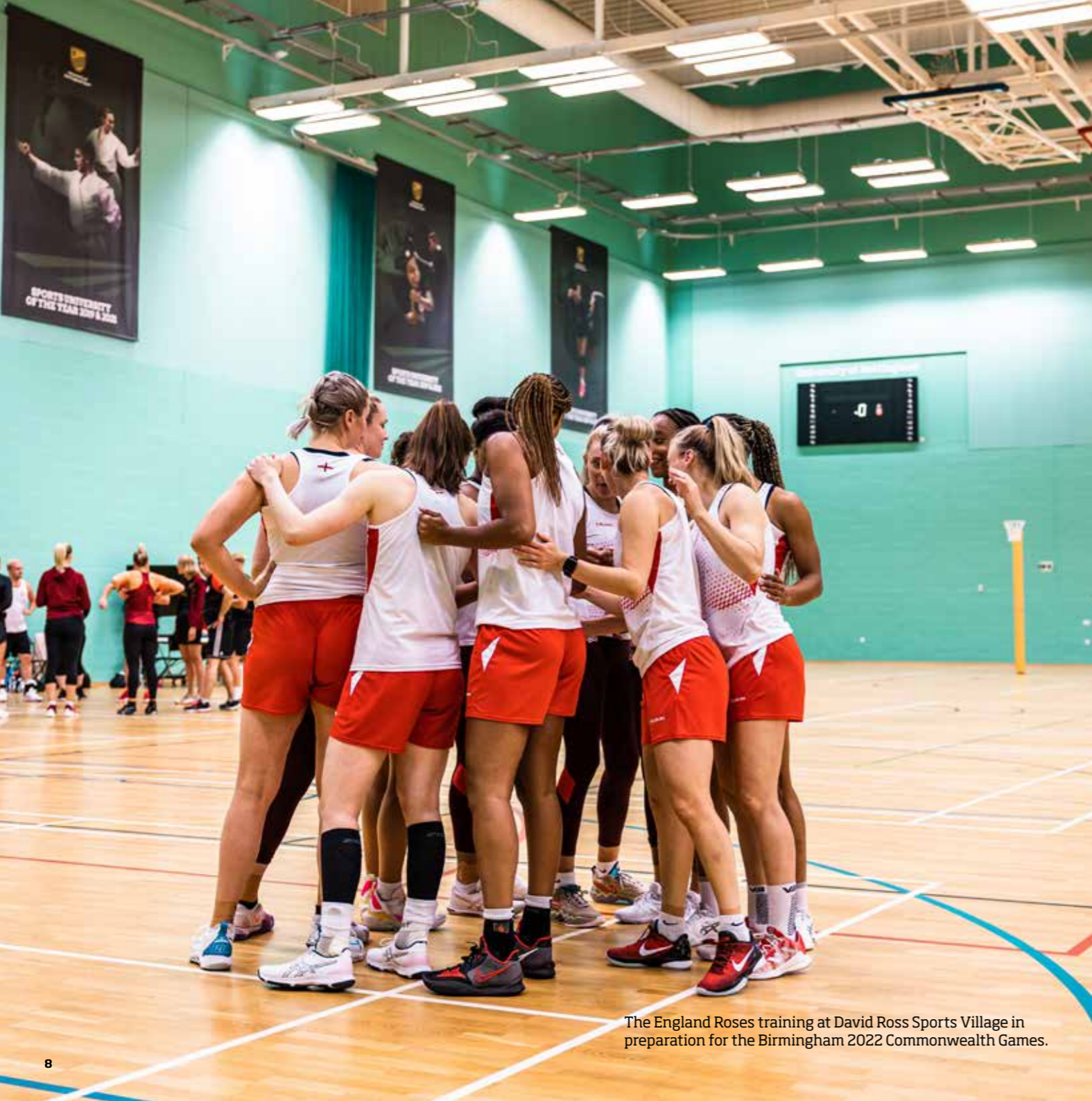
The England Roses training at David Ross Sports Village in preparation for the Birmingham 2022 Commonwealth Games.