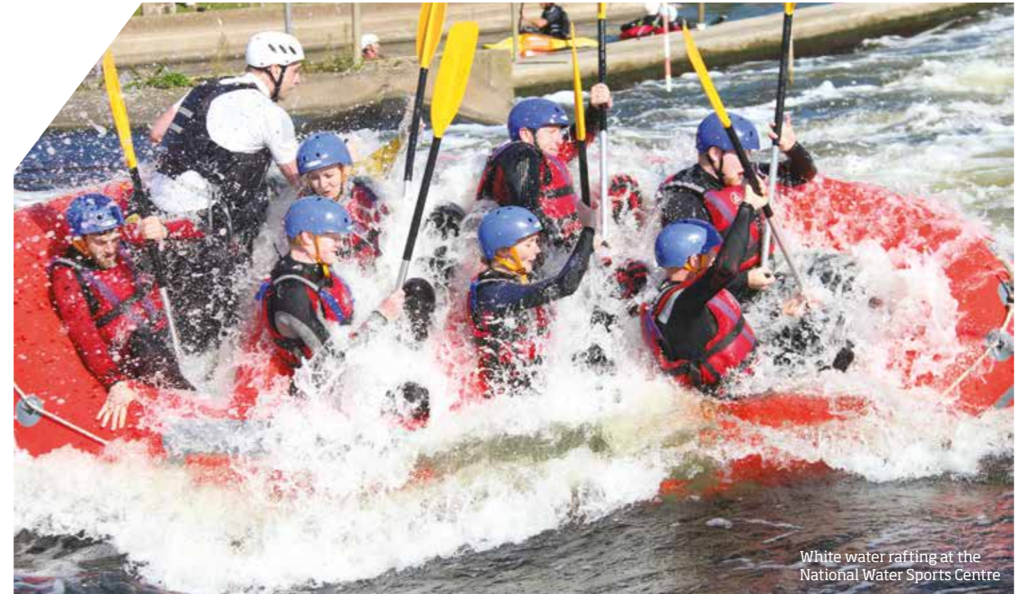
White water rafting at the National Water Sports Centre