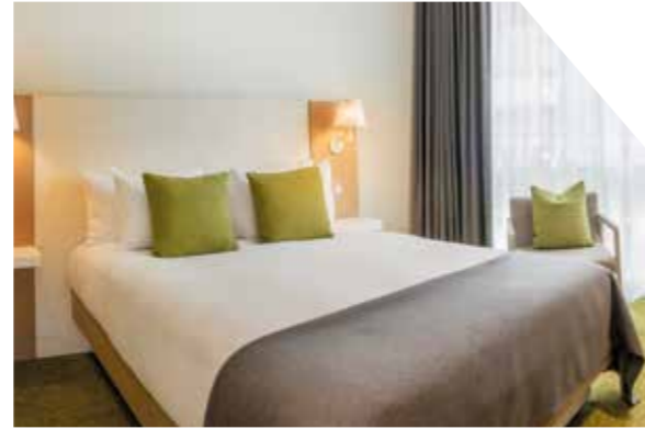
The Orchard Hotel Double Room