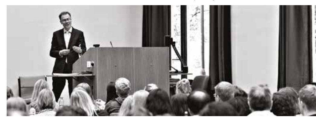
A practical guide for academics and researchers