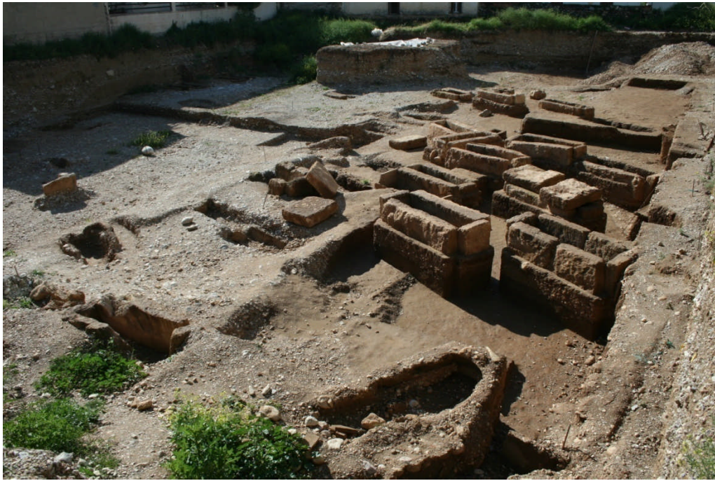
FIG. 2 A late Classical burial cluster NE of Argos.

The pattern seems to have been modified, in the early Hellenistic period or just before. Shortage of space as the result of marked population growth led people to place their dead wherever there was available space. 14 Hellenistic graves are found on the outskirts of Classical or even earlier burial grounds or are cut into them. 15 This more individualized way of placing the dead in the Hellenistic period was probably also related to the individual's wealth. Monumental tombs containing multiple wealthy burials were increasingly erected along roads during this period. 16 They were thus visible