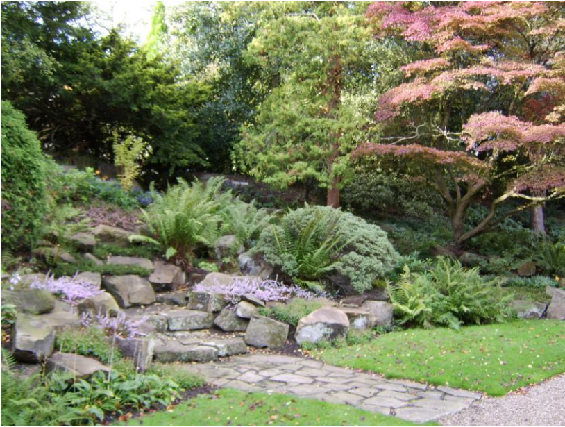
Hugh Stewart Hall

This year has seen the renovation of the Hugh Stewart Rock Garden. For the first time since the founding of the Friends of University Park Group we have been able to involve student volunteers in the scheme.