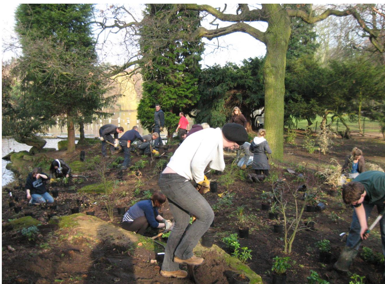
Student Volunteers and University Grounds Staff Working on Highfields Park in February 2011