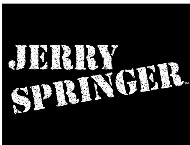
Figure 3. Logo for The Jerry Springer Show .