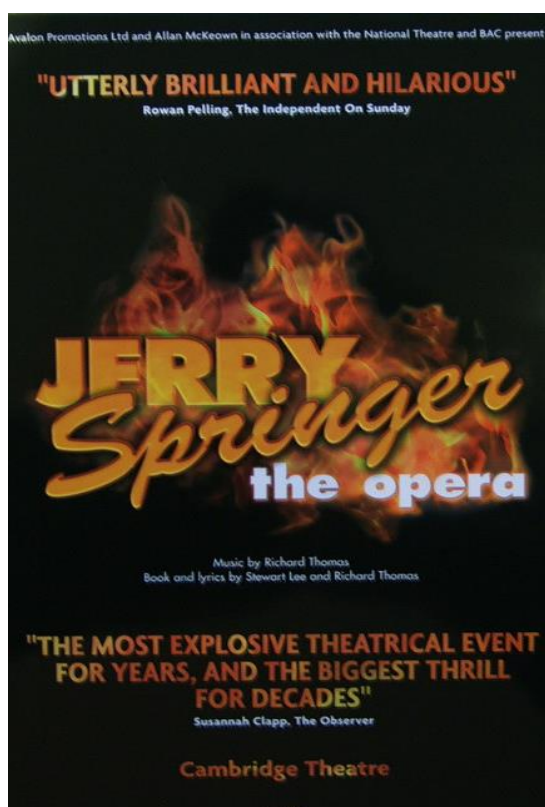
Figure 2. Production poster for Jerry Springer the Opera at the Cambridge Theatre in 2003.