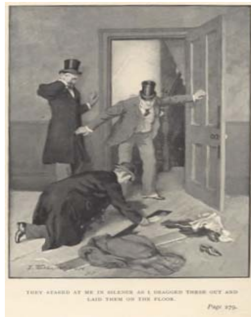
Figure 5: John Williamson's fourth illustration: the detective element (author's private collection).