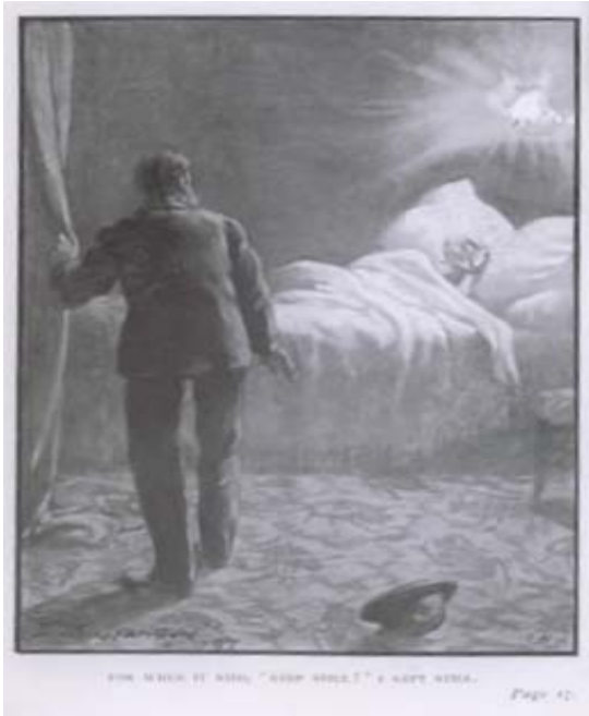
Figure 2: John Williamson's frontispiece to The Beetle : the tramp and the mesmerist (author's private collection).

The attractiveness of the first edition was further enhanced by the inclusion of four greyscale illustrations by John Williamson, illuminating occult, criminal and romantic developments in the novel and thus appealing to different reader interests (figures 2-5).