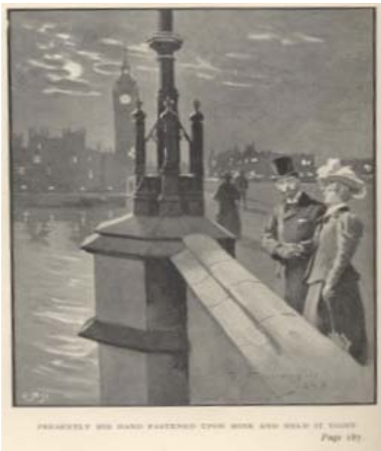
Figure 4: John Williamson's third illustration: the romantic element against the Westminster backdrop (author's private collection).