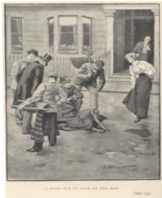
Figure 3: John Williamson's second illustration to The Beetle : outcast London and fashionable London meet (author's private collection).