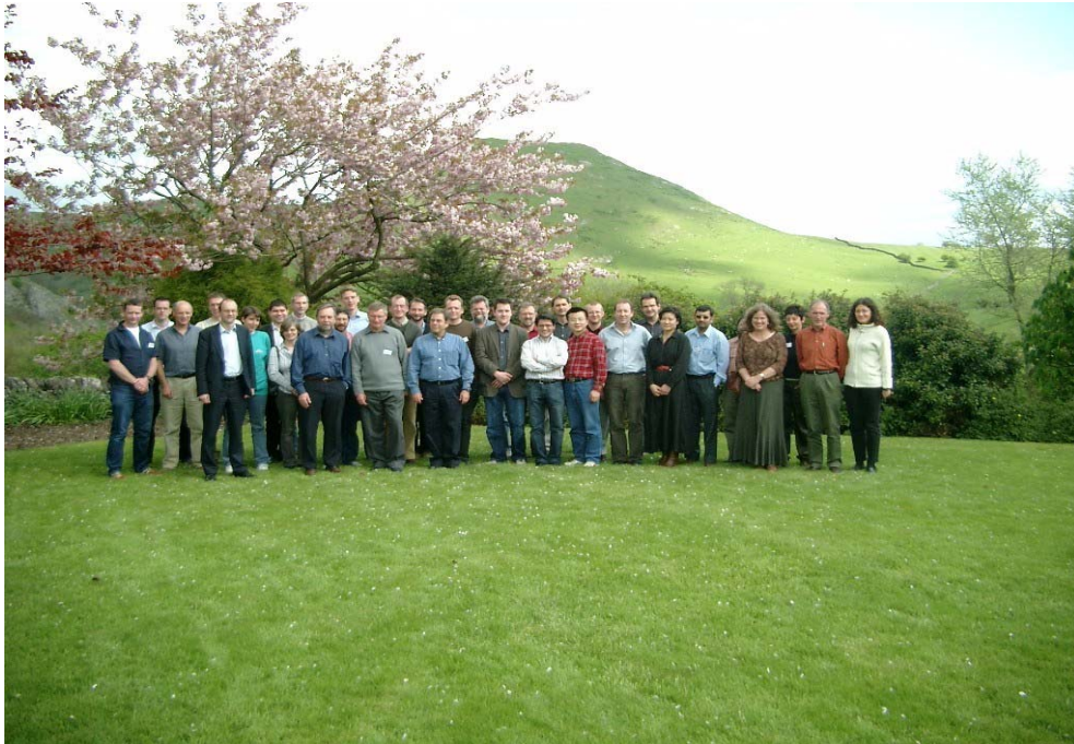
The 2005 GEP Research Retreat

Financial support from the University of Nottingham in co-funding the Leverhulme Chair in International Economics is also gratefully acknowledged.