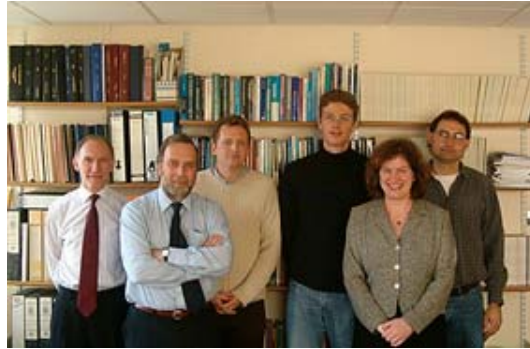
GEP Management Committee