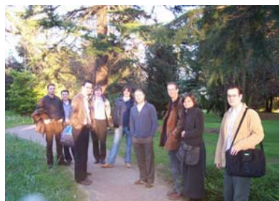
Delegates at the Fourth Annual Postgraduate Conference