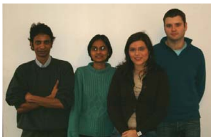
GEP PhD Students

As noted in previous Annual Reports, our Research Students and Research Fellows do consistently well in being appointed to positions at strong Universities in the UK and overseas.