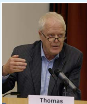
Thomas Hammarberg addresses AHRI Conference