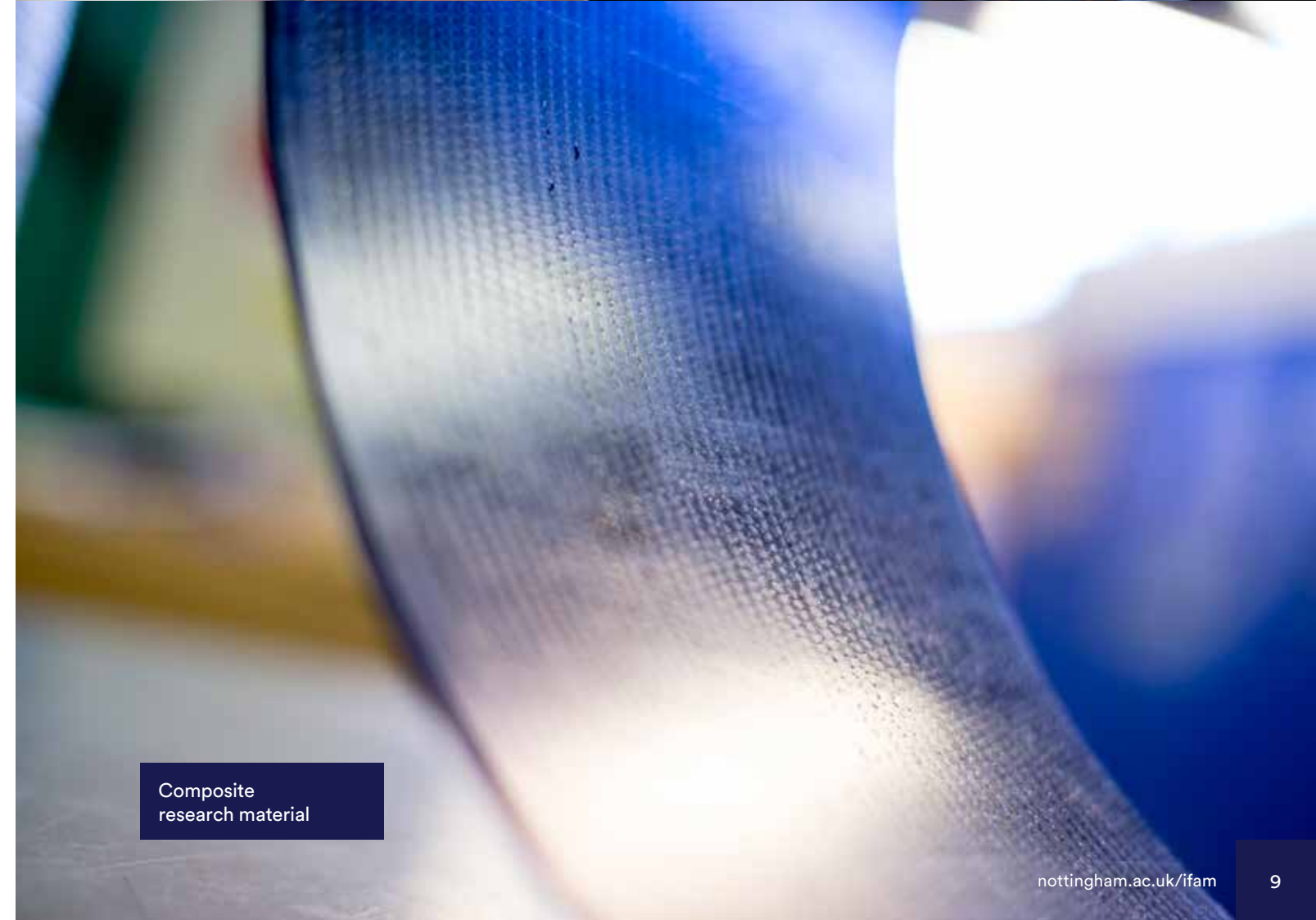
Composite research material