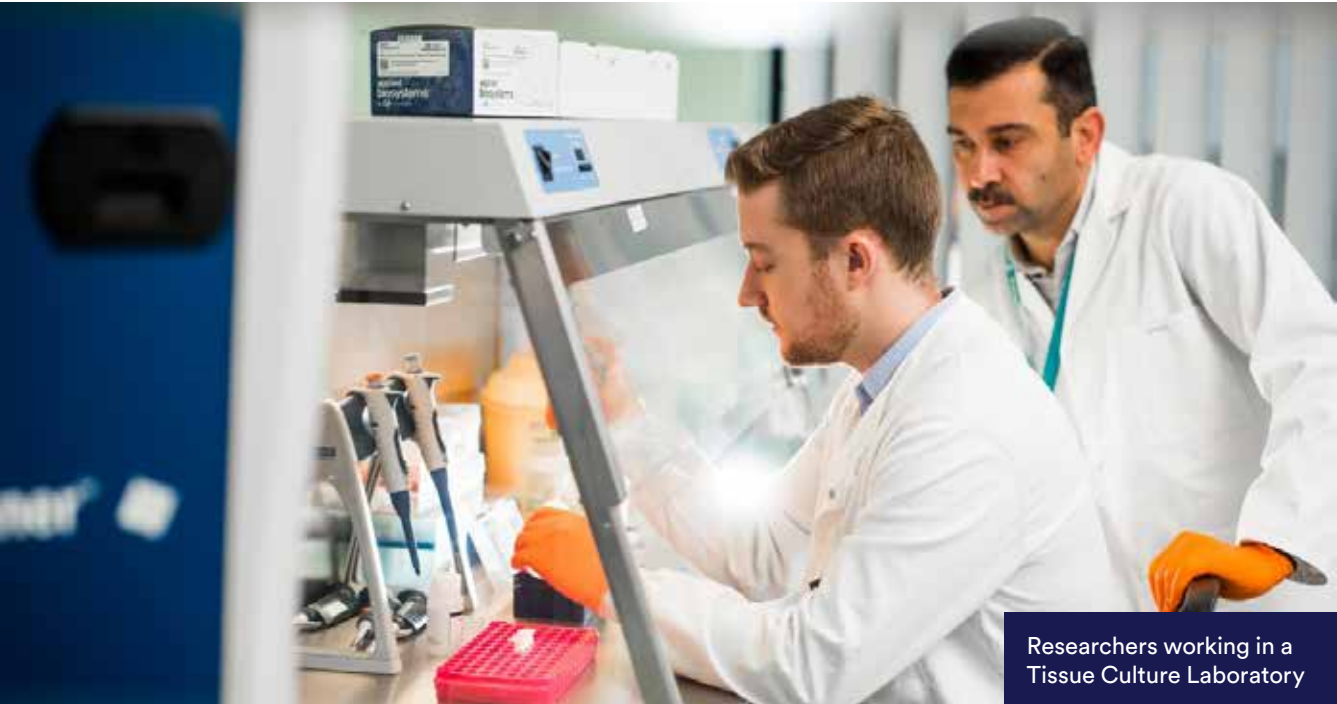
Researchers working in a Tissue Culture Laboratory

One example of where regenerative medicine could benefit patients is in hip surgery. Our researchers are developing material that could be injected into a patient's leg that would bond with cells and repair the damaged area. This could replace the need for invasive hip replacement surgery.