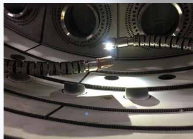
Two continuum robots carry out in-situ repair

You can find more information about this project online at: https://gtr.ukri.org/projects?ref=102360