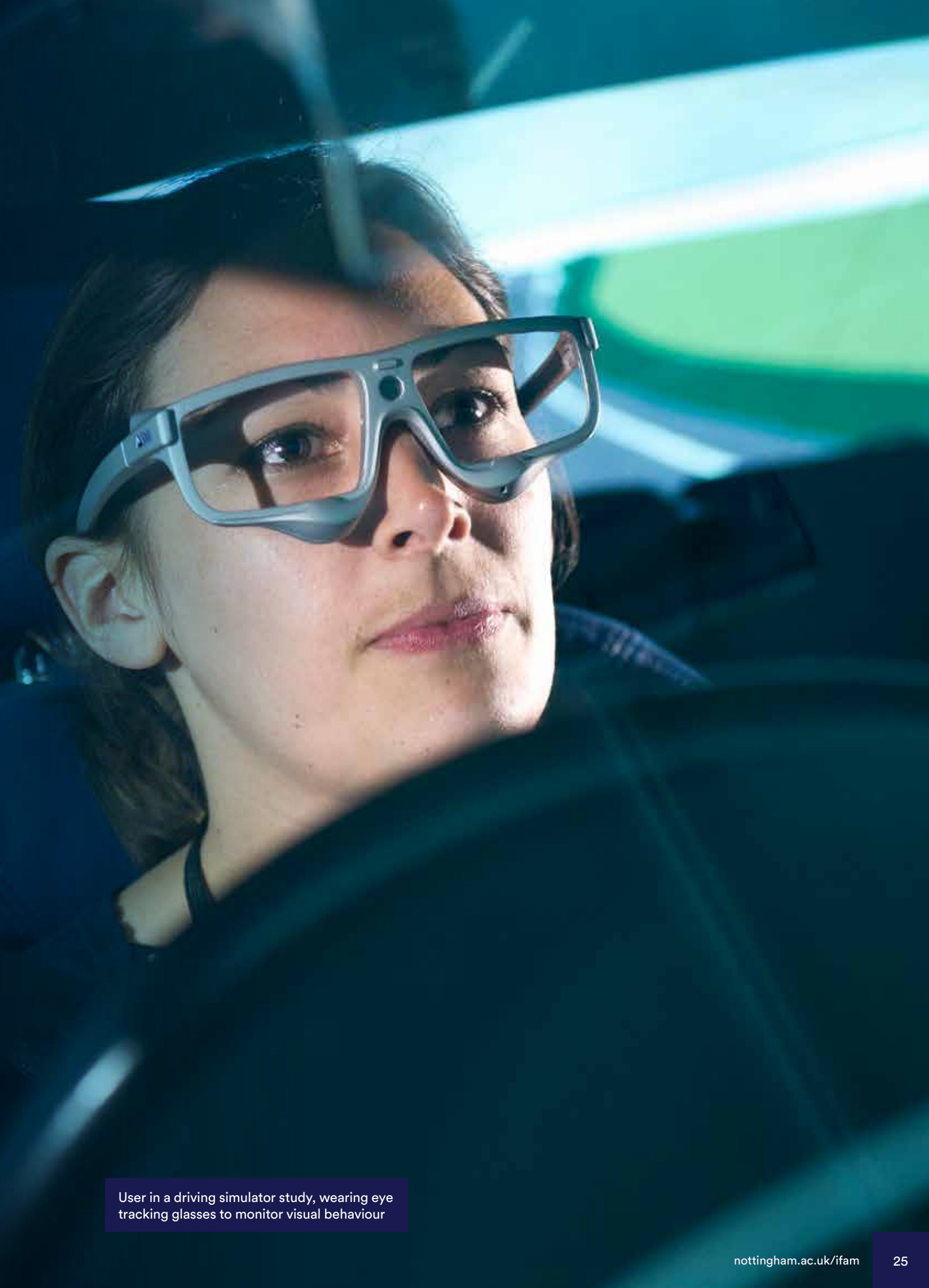
User in a driving simulator study, wearing eye tracking glasses to monitor visual behaviour

In 2018 we were awarded a £1.9 million EPSRC project to develop tools to enable industry to implement digital manufacturing technologies through the consideration of human requirements and technical capabilities. This project, which collaborates with the Universities of Cranfield, Loughborough and Bristol Robotics Laboratory will consider technologies including digital twins, robotics and physiological sensing to understand how multiple data sources can be combined to effectively support future digital manufacturing workplaces.