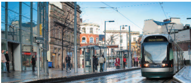
The Transport Systems Catapult aims to better use data to optimise the movement of people and goods

immediate alternatives when there is disruption.