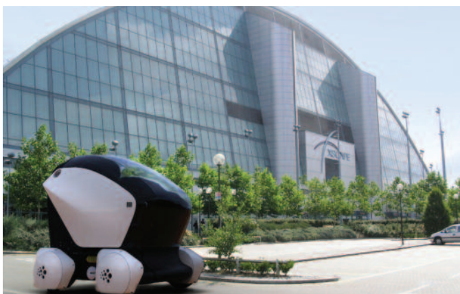
An early concept design of the driverless pods being trialled in Milton Keynes next year

solution aimed at the first objective of 'Improving the traveller experience at modal changes' can be seen in one of the demonstrations on display at the "Innovation" centre. A computer model visualises the stress levels of people travelling in and out of a train station, depending on the level of crowding. Various scenarios can be modelled to assess the impact which entrance closures at the station could have on the mood of the people in the area. Such data and models might be used to test layouts of future transport hubs to ensure they are built in the best way possible both socially and efficiently.