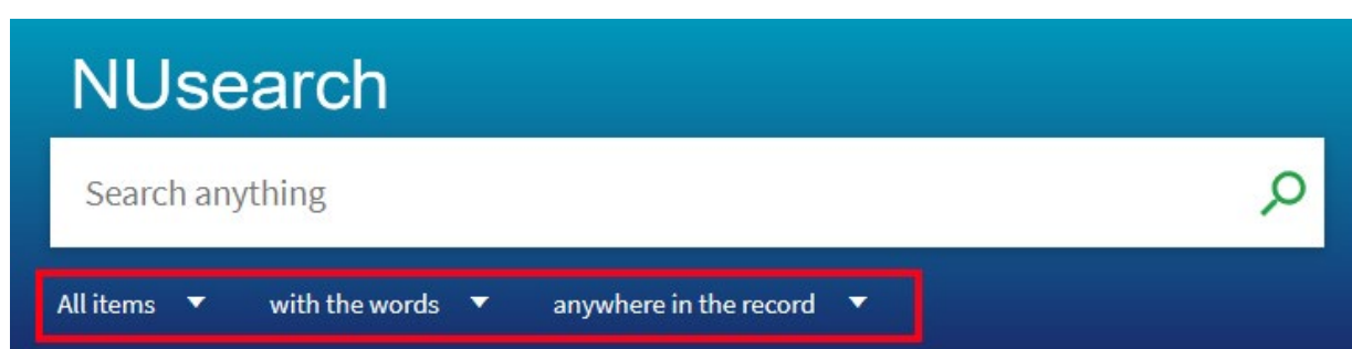
Image 2: Basic search showing the three pre-filter drop down options under the search box.

You will find the new pre-filters as three drop-down options under the search box.