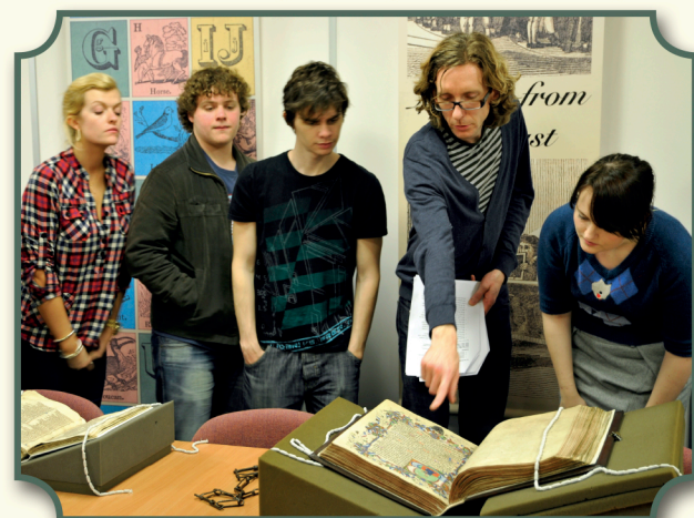
Lecturers bring small groups of students to experience working with primary sources.

also examines the changing fortunes of published authors.