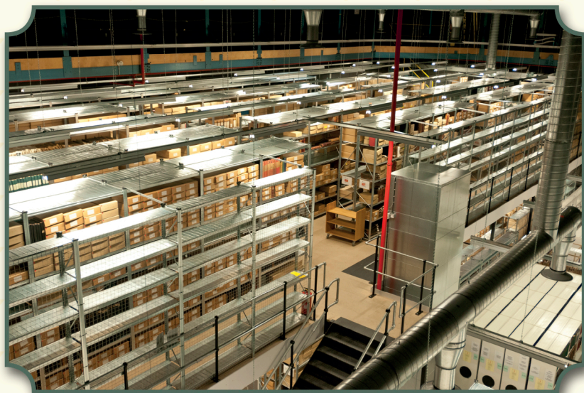
The archive store. The converted television studio houses over 3.5 million documents and 80,000 printed volumes.

The display examines how Nottinghamshire itself – in everything from the beauty of its countryside to the harsh realities of its industrial working life – has acted as a source of inspiration for writers through the centuries.