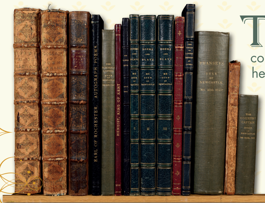
The Portland Literary Collection features manuscript poems, plays, and 17th and 18th century satire.

This exhibition is drawn from the rich collections of literary archives and printed books held by Manuscripts and Special Collections at the University of Nottingham. These collections originate from diverse sources including the libraries of local aristocratic families, the research materials of academics, and donations from novelists, poets and playwrights themselves. The University's DH Lawrence Collections and Portland Literary Collection have been designated as being of outstanding international significance.