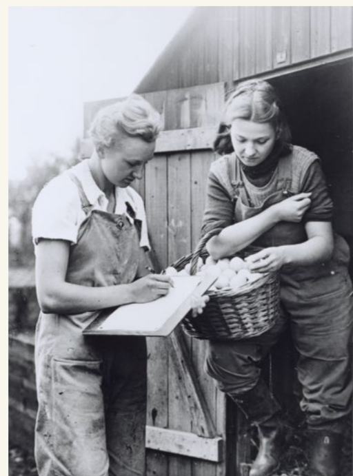
Above: Land Army girls egg collecting and recording, Sutton Bonington campus, 1939.