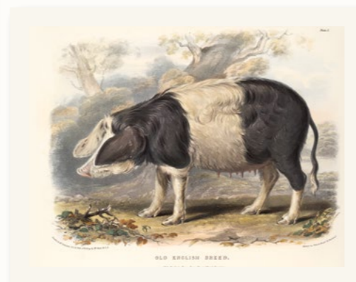
Left: 'Old English Sow', from David Low, The breeds of the domestic animals of the British Islands , Volume 2 (1842). University of Nottingham, Special Collection Oversize X SF105.25.G7.L6