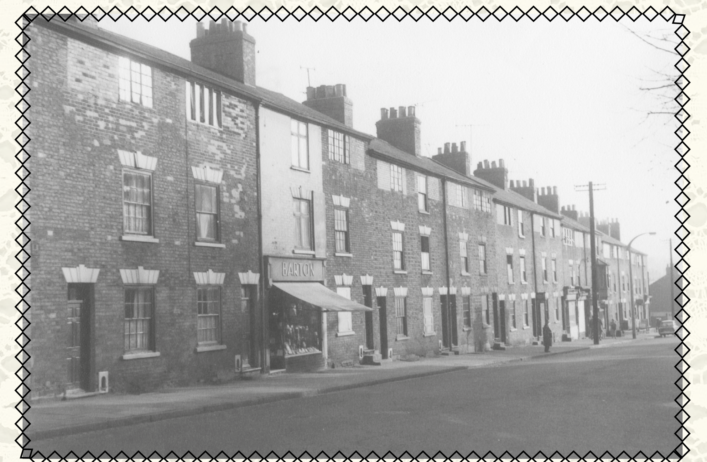
Framework knitters' houses on Hucknall Road, Carrington, Nottingham, c.1959-1961 MS 627/1/1/16.