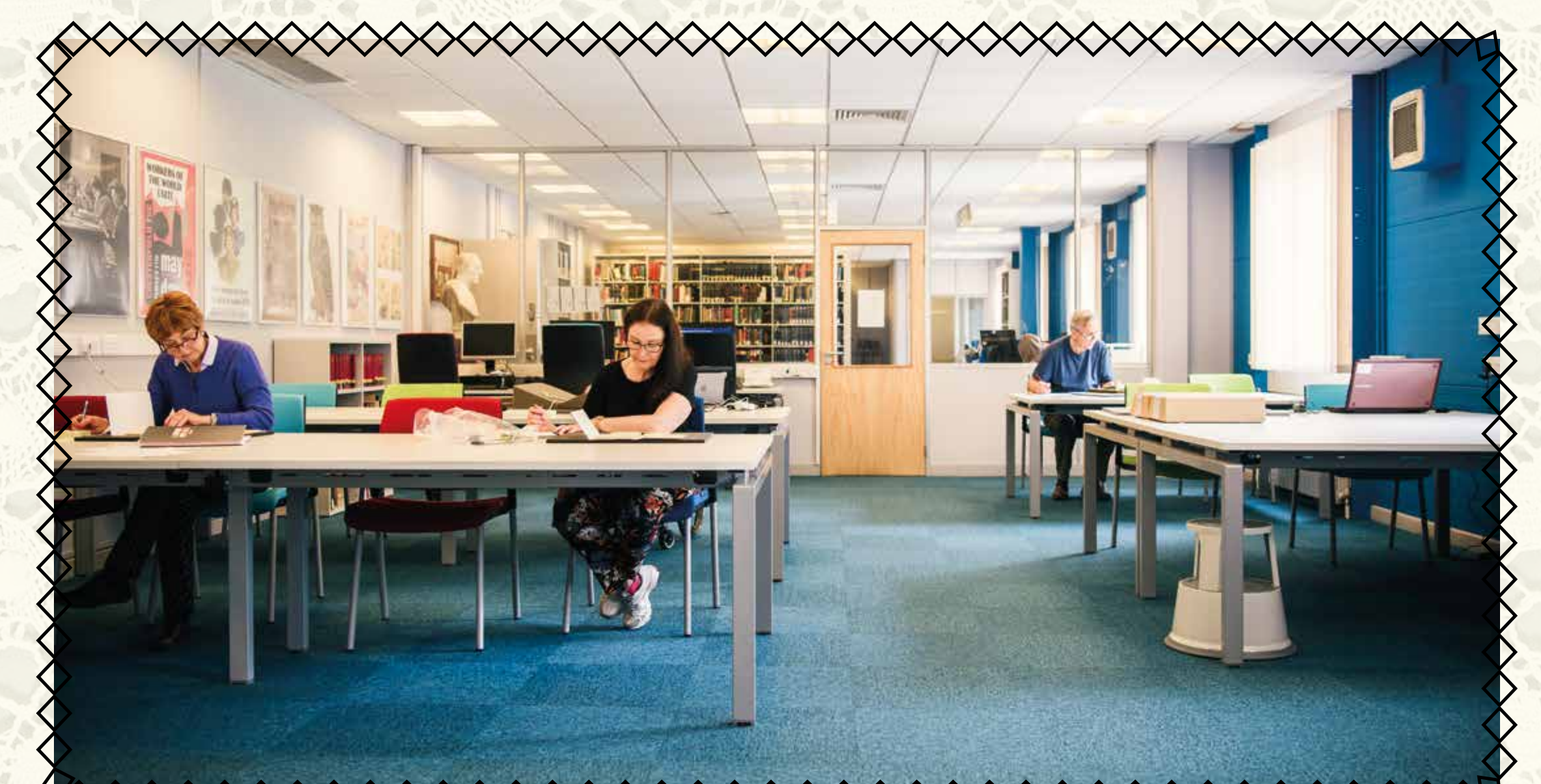
The archive collections are accessible in the public reading rooms at the University's King's Meadow Campus.