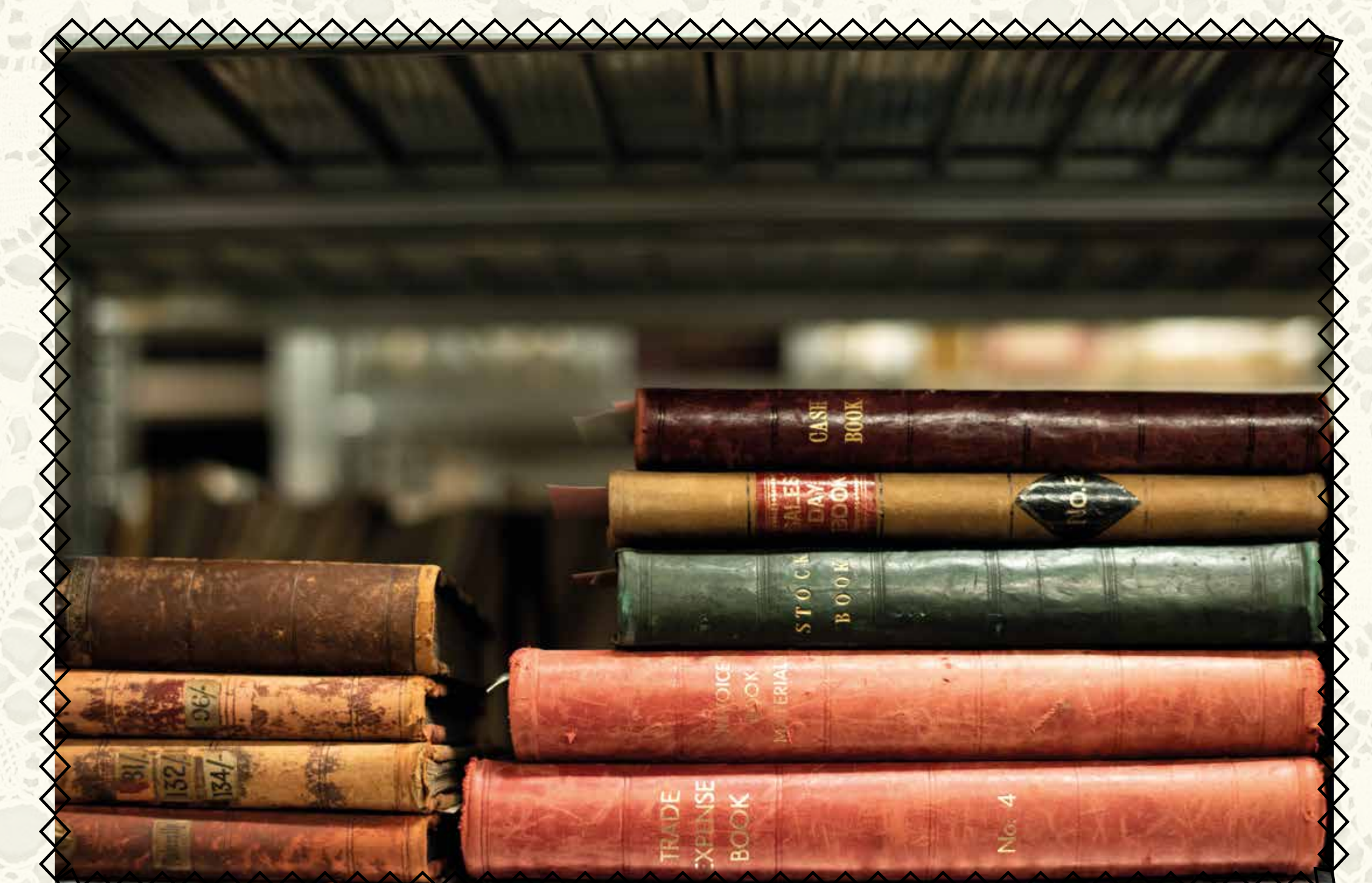
Examples of business ledgers too large to fit in the exhibition cases.