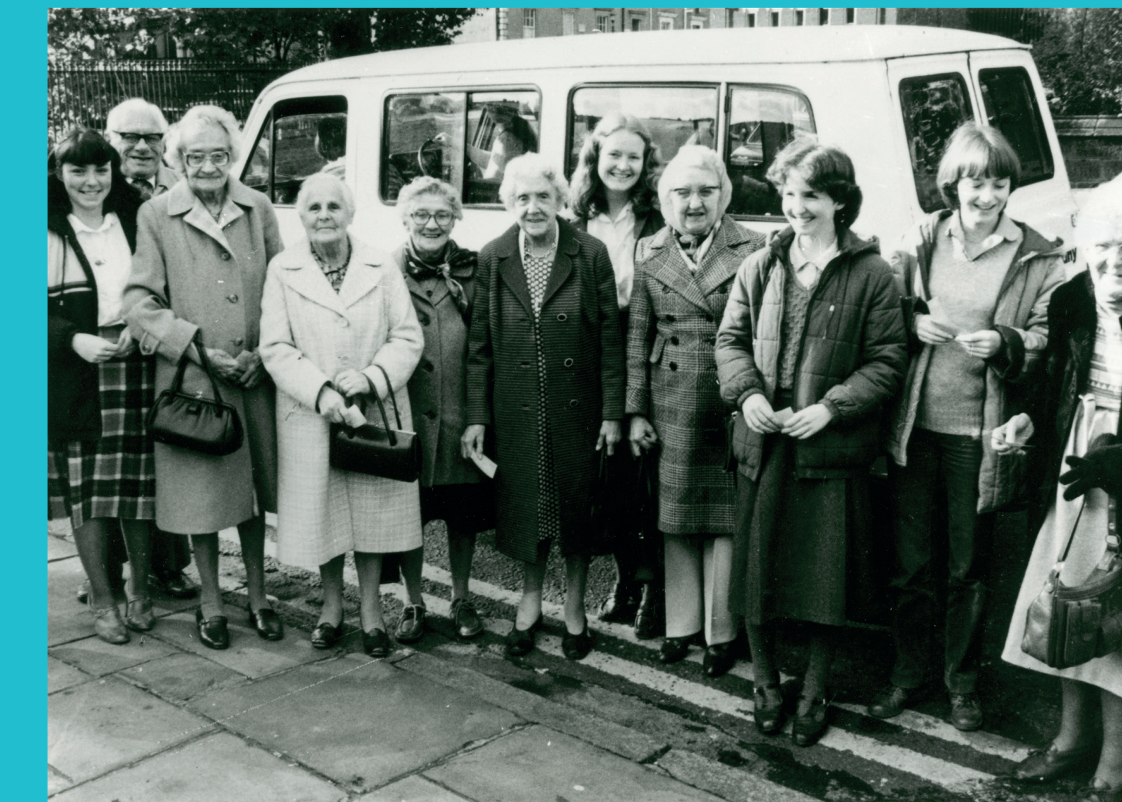
Student volunteers taking part in Community Action escorting pensioners to see A Midsummer Night's Dream at Nottingham Playhouse, October 1981. The event was funded from Karnival profits. From University Collection, Acc 904/1