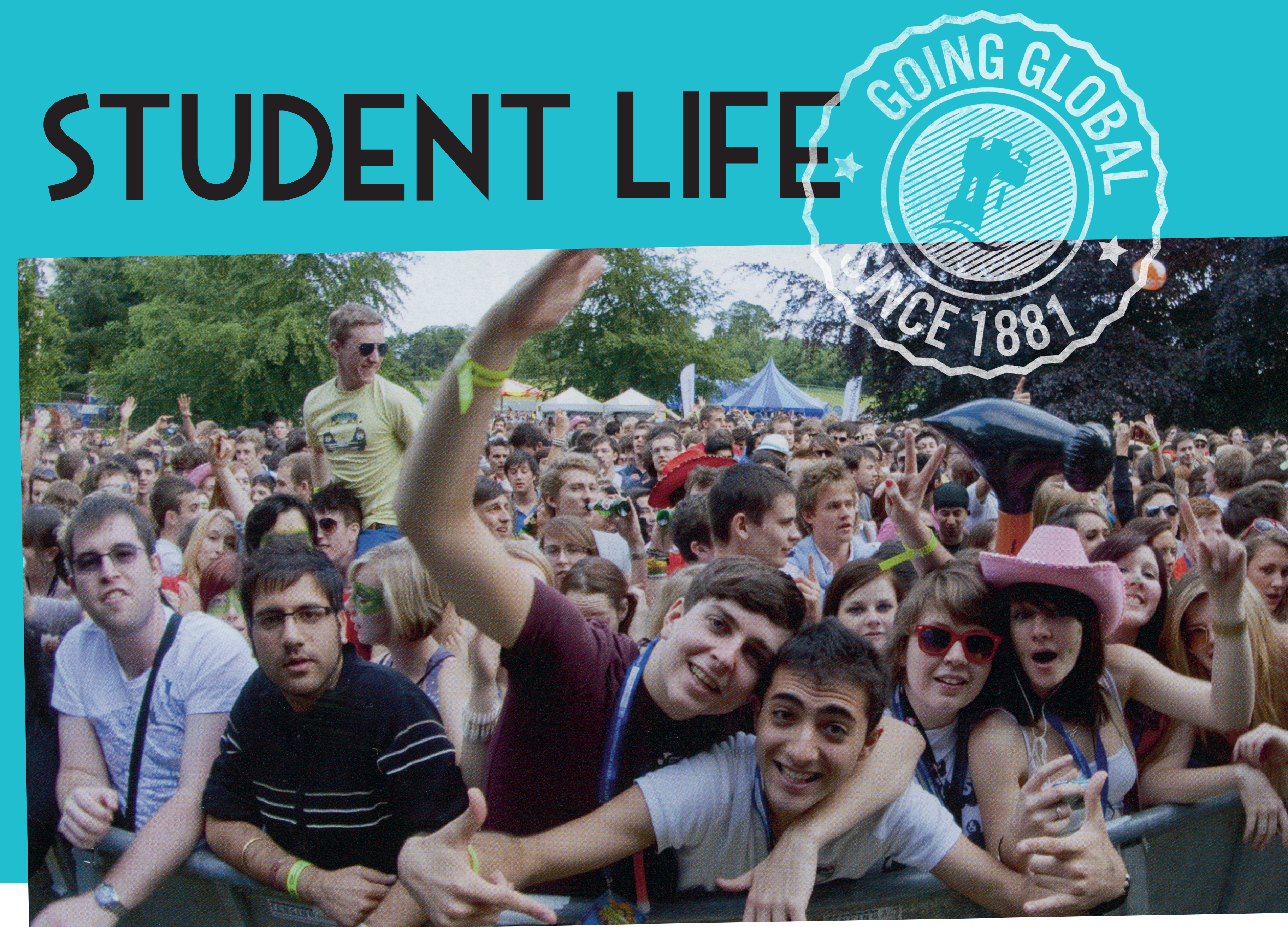
Students enjoying the end of term party on The Downs, June 2011. From Impact #211 June 2011, p31. East Midlands Special Collection Periodicals: Not U.

Students are the life and soul of the university. With more than 40,000 students from 150 different nationalities studying at the various campuses, student life is inevitably diverse and varied.