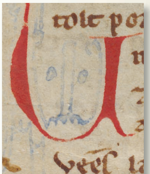
The features of a man's head can be detected within this initial 'U' (WLC/LM/6 f.206v).