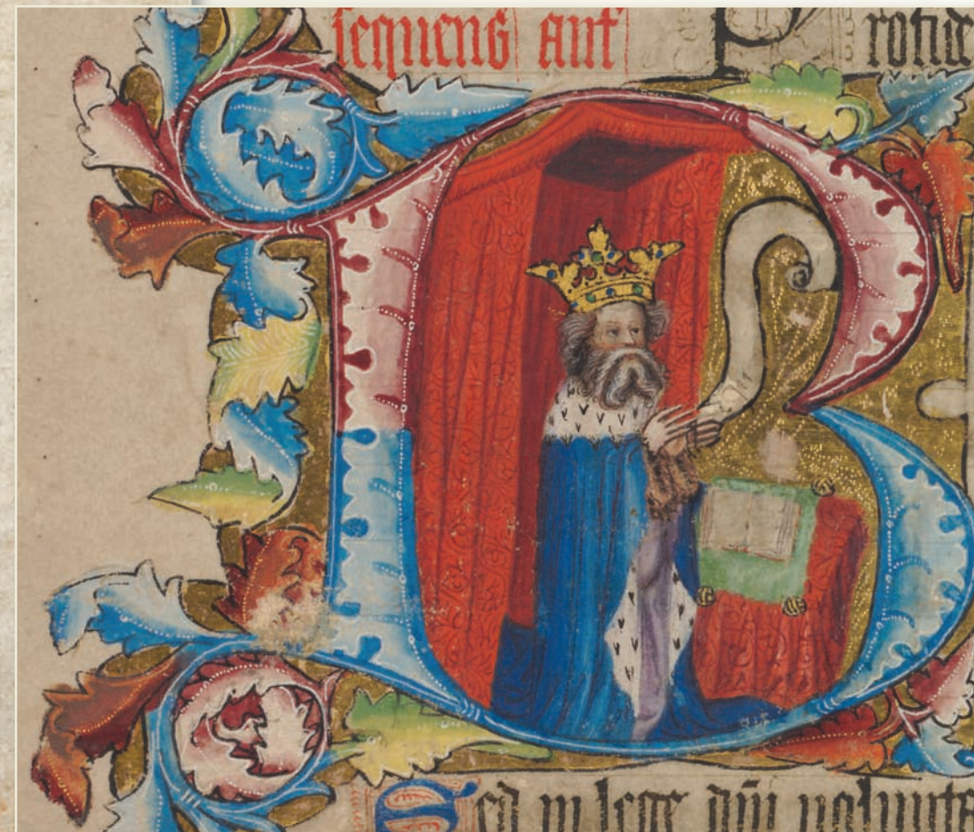
King David, the psalmist, with a scroll, Wollaton Antiphonal (MS 250 f.213).