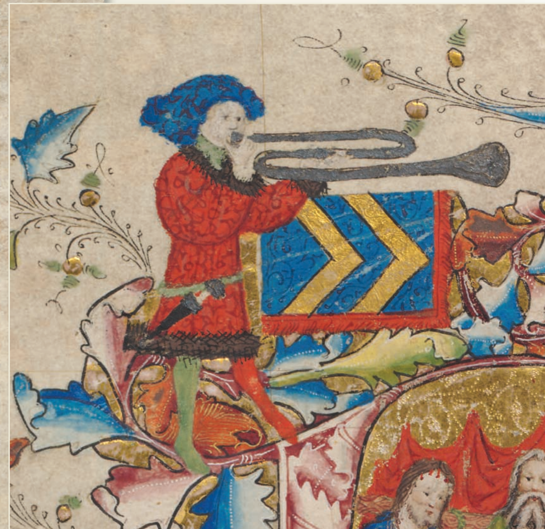
A trumpeter displays the Chaworth arms, part of an elaborate heraldic display, Wollaton Antiphonal (MS 250 f.246v).

Decoration of a medieval manuscript, like that of a modern web page, served a number of functions and took many different forms. A balance of text and image helps the reader to find his place and conveys implicit messages about the owner or author as well as being visually appealing.