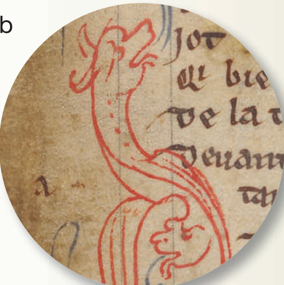
A dragon's head appears in occasional flourishes (WLC/LM/6 f.314).