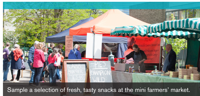
Sample a selection of fresh, tasty snacks at the mini farmers' market.

Location: Behind Pope Building, next to the Chemistry Building.