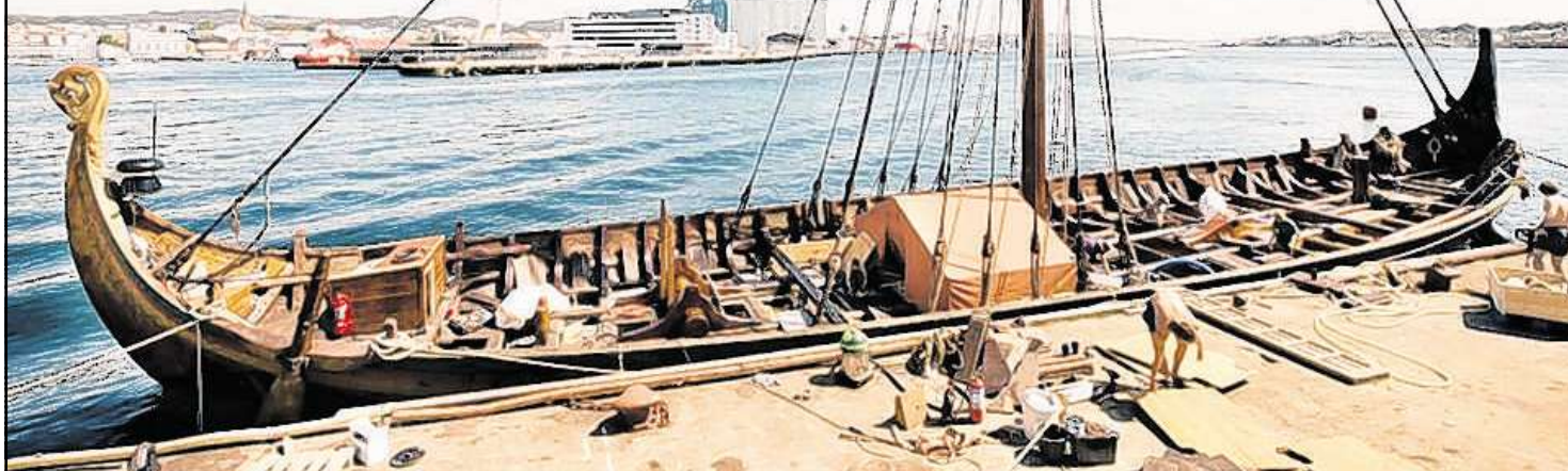
FITTING OUT: Viking longship the Draken Harald Hårfagre preparing to leave Haugesund