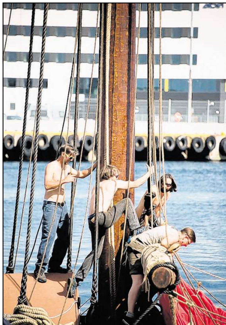
FINAL CHECKS: The Draken Harald Hårfagre preparing to leave Haugesund