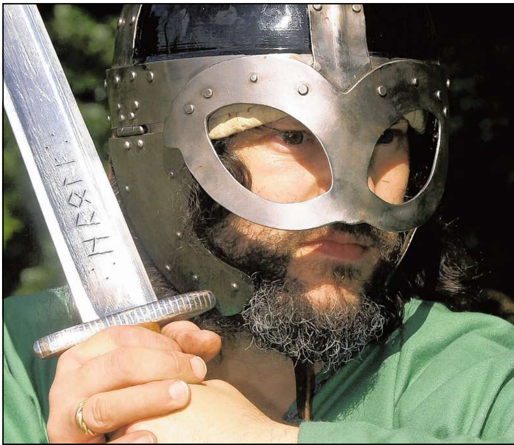
● West Lancashire still retains strong links with its Viking past

THE findings of a major study into West Lancashire's links with the Vikings are set to be revealed this month.