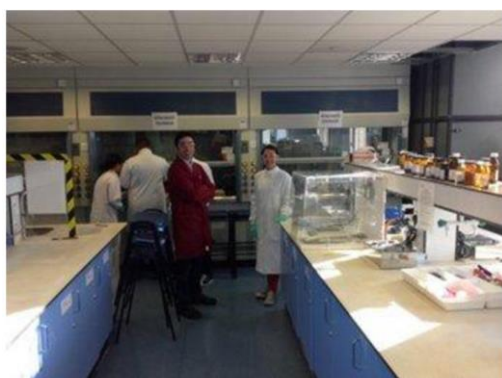
Students from the drug discovery team in the lab