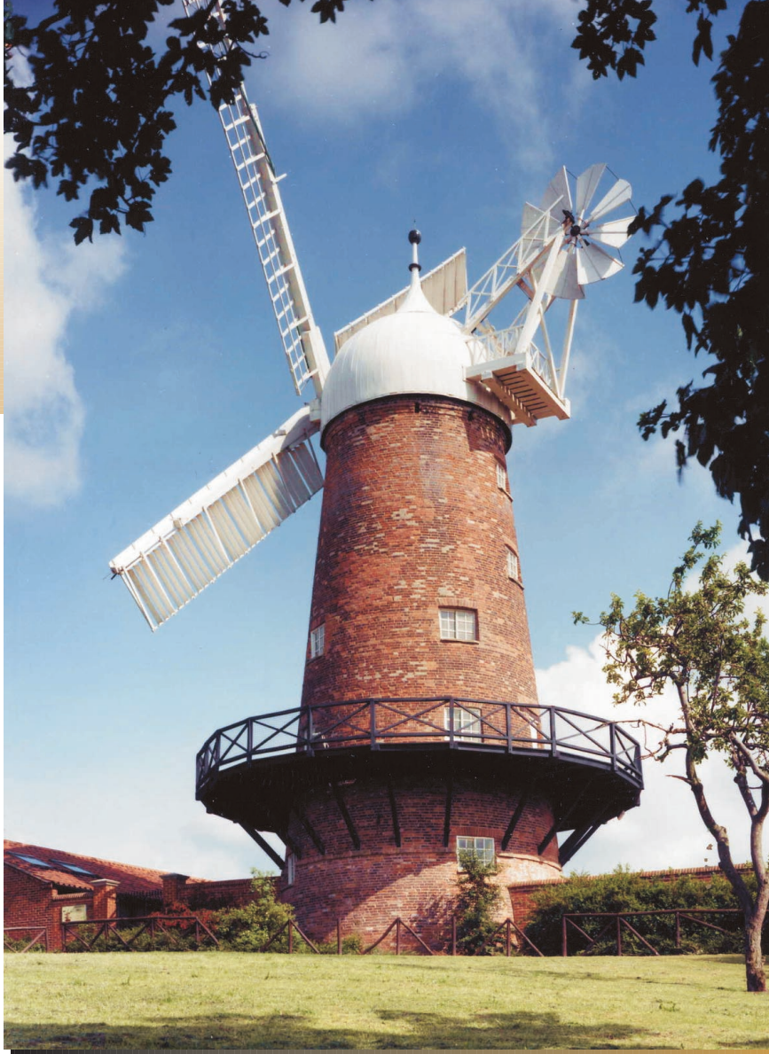
Figure 1. Green's mill , restored to working order in 1985, is located in Sneinton, England, within a mile of Nottingham's city center. The George Green Science Center in the mill yard features hands-on science exhibits and multimedia displays that illustrate Green's life.

Library. Few if any could have understood the essay, so they must evidently have had considerable confidence in its author's abilities.