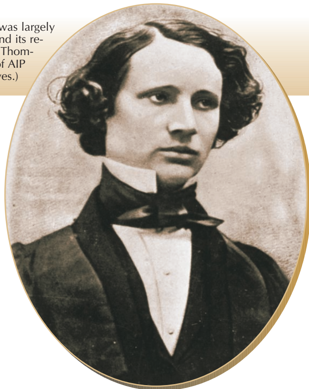
Figure 4. William Thomson, later Lord Kelvin (1824–1907) was largely responsible for the rediscovery of George Green’s 1828 essay and its republication (1850–54) in Crelle’s Journal. This photograph of Thomson was taken in 1846.