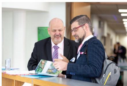
Signing a copy at the conference

The purpose of the book is to provide a framework for future discussion and prompt some debate on where we have reached and where we need to go in achieving effectiveness in development aid procurement.