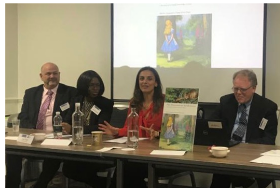
A workshop to launch the book...

This book explores the links between procurement and aid effectiveness and examines the various initiatives that have been undertaken by the international community to make aid more effective. While the on-going international reform process for development aid procurement will shape the future success of development aid, little is known about the shape, form, governance and power imbalances that underpin it. Reforms tend to be piecemeal and respond to isolated problems. The absence of a broader academic debate has resulted in a limited framework and restricted parameters with which to address the problems raised analytically.