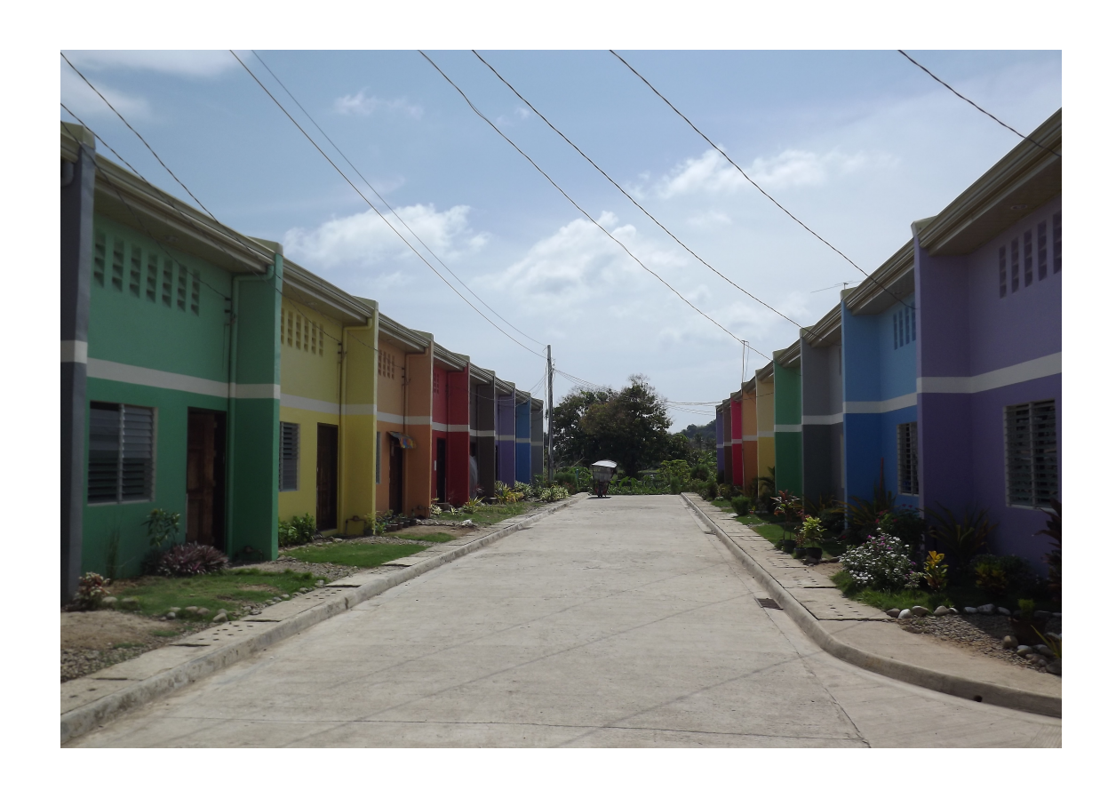
'Hope for the Philippines' The Peninsula – Gawad Kalinga (GK) Village, Tanauan.

In contrast to Tacloban, Pel Tecson was keen to move residents to permanent shelters even if utilities were not connected yet to the new housing units. According to Tecson the lack of water was not a reason to hold up relocation as 'we have installed water pumps and faucets. I always argue that the people are better off moving versus staying in the danger area as their living conditions are way, way better than before'41. However, in FGDs and interviews, some relocated people still come back daily to their original areas for work and children to study in their original schools. According to one barangay official, some of these resettled people complain that their new areas still have limited utilities and are prone to flooding.