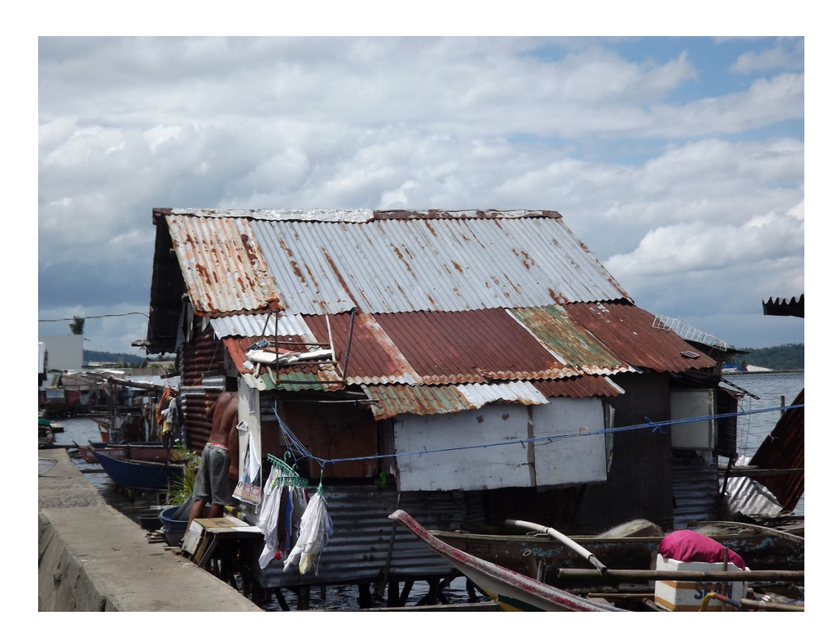
Magallanes, Tacloban, September 2016.

blocs and corrugated iron roofs. These houses were located near or even over the sea, in what is now classified as the no-dwell zone, on stilts. Pathways along these communities were made up of a network of sea walls. These vulnerable communities had been rebuilt, often with reclaimed or recycled materials, despite being in the no-dwell zone. The house below is in the Magallanes area of Tacloban and is built on stilts over the sea. The sea wall can be seen on the left.