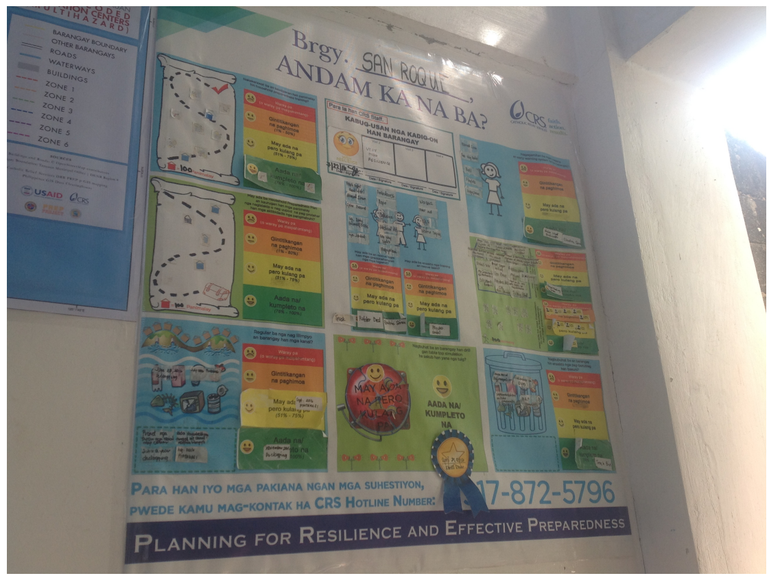
Barangay San Roque's Assessment of its Disaster Preparedness Based on its DRMM drill conducted with the help of CRS