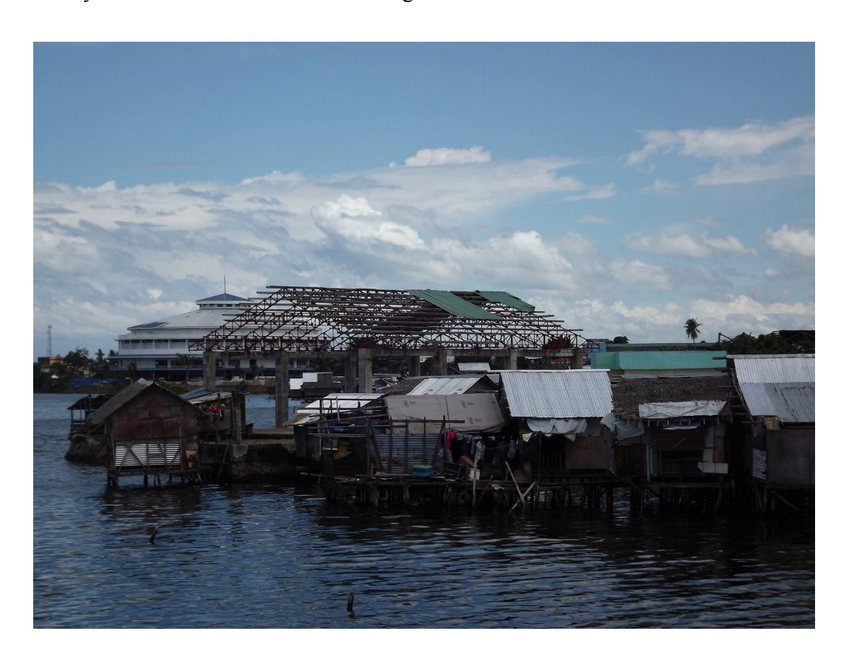
Magallanes, Tacloban with the Tacloban Astrodome in the background.

figure of 20 percent had been relocated. In the photograph below in-situ repairs can clearly be seen in the form of new roofing.