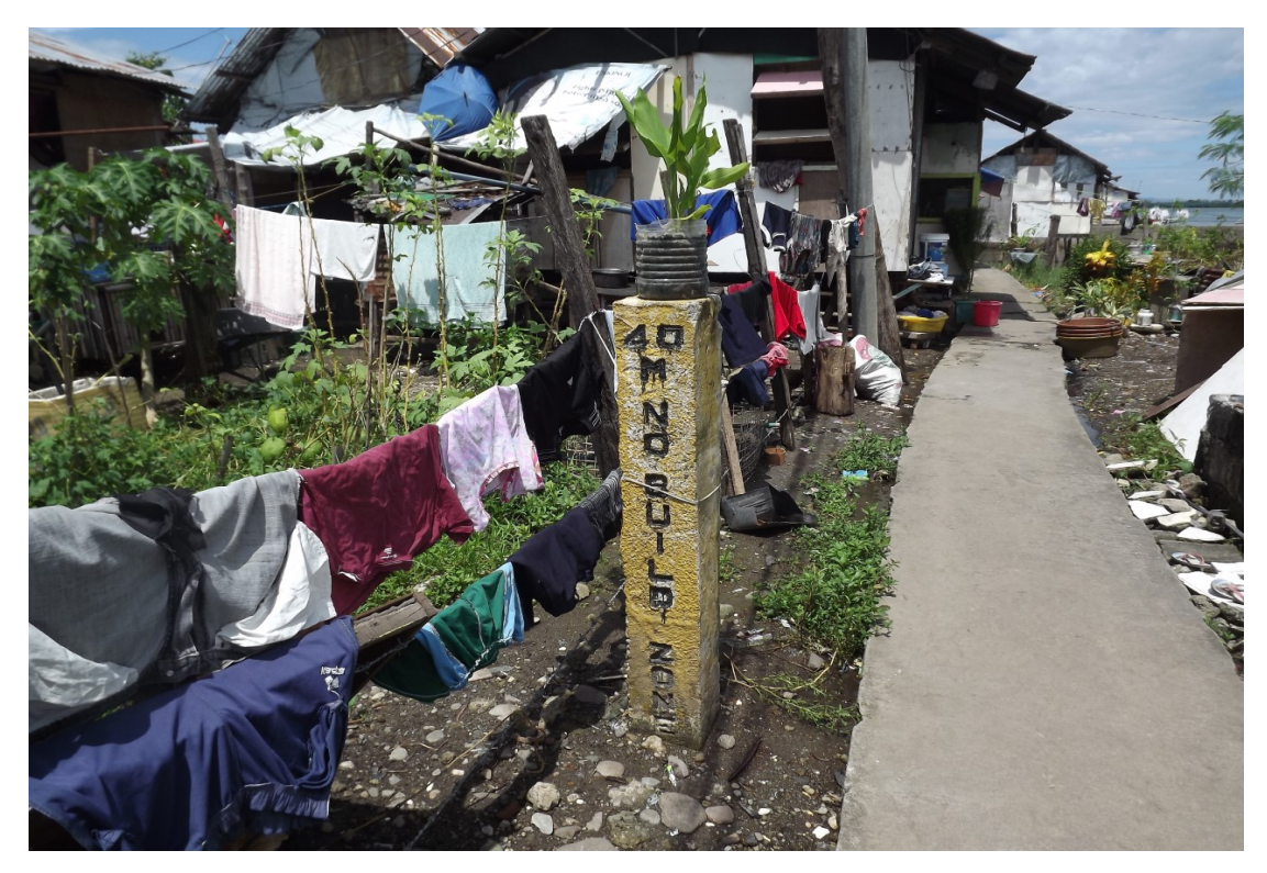
No Build Marker with houses in the zone, Magallanes, Tacloban September 2016.

This no build zone was designed to stop people rebuilding in the danger zone on the premise that they would be prioritized for relocation to safe housing. However the construction of permanent, or even transitional housing<sup>23</sup>, has been painfully slow. Not least because of delays in downloading reconstruction and relief funding from the national government<sup>24</sup> and alleged corruption and criminal negligence<sup>25</sup>. This has left the local government with no choice than to tolerate rebuilding in the no build zone, as they are unable to come up with a practical alternative. This has been a particular problem in Tacloban. We saw for ourselves houses that had been rebuilt well within the no dwell zone and even over the sea on stilts. We encountered differing reactions to the prospect of relocation. Some residents living in the no dwell zone indicated that they were keen to move, notwithstanding concerns over lack of livelihood opportunities in the relocation areas. However, the no dwell zone has also been