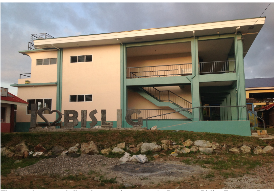
The new barangay hall and evacuation centre in Barangay Bislig, Tanauan, Leyte

Several barangays are also recipients of the Disaster Risk Reduction Management (DRRM) project of CRS, a US-based NGO. Aside from donated communications and life-saving equipment turned over to the barangays, the barangay officials and residents received DRRM training and drills in preparation for any emergency. FGD participants and key informants noted that they now know what to do during typhoons and they now evacuate immediately when a typhoon is coming. Some barangays, like Salvador and San Roque, already have Disaster Plans. One common complaint though is that even with these developments, sustainable livelihood and poverty remain problems, especially for farmers who rely on coconut farming. However, the DSWD, NGOs and some aid agencies, in coordination with the municipal government, have given some livelihood training, equipment and supplies, e.g. rice seeds, pedicabs, piglets, etc. to residents, especially associations of women, fisher folks, farmers and pedicab drivers.