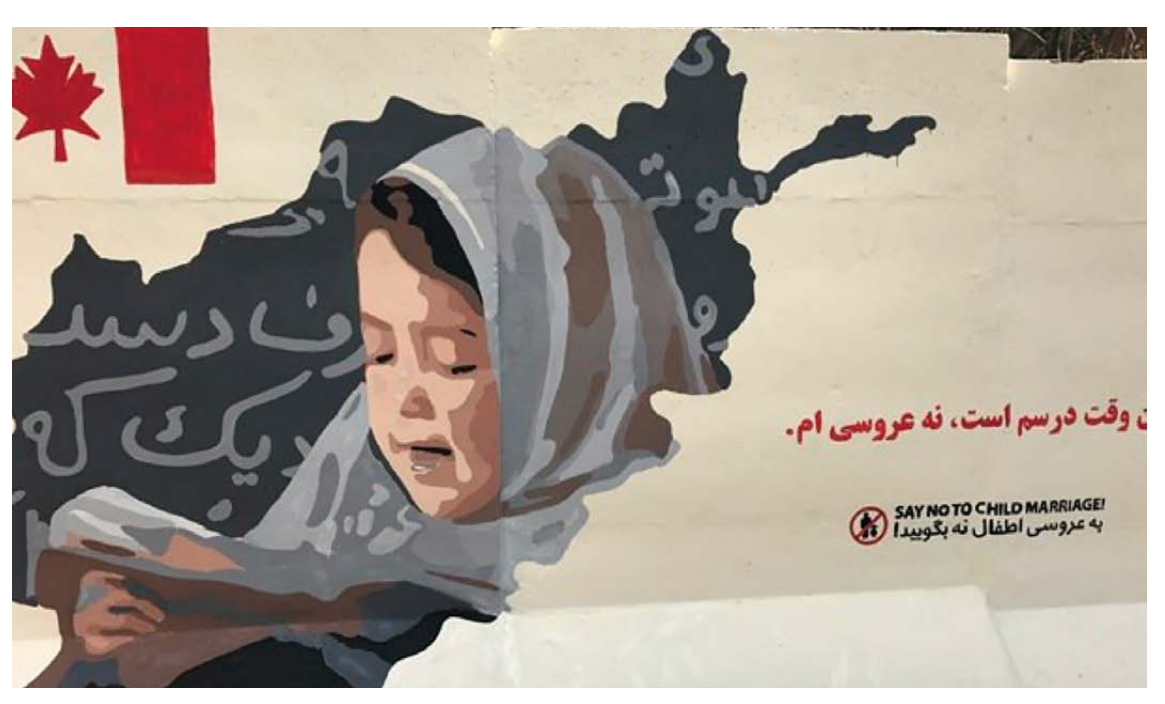
ArtLords, 'Say No to Child Marriage', 2016

Currently, there is a large evidence gap in the experiences of adults who undergo forced marriage. Within the SDGs, 5.3 specifically refers to forced marriage, but primarily focuses on child or early marriage. As the indicators under 5.3 do not reflect the full situation of forced marriage worldwide, this kind of forensic analysis of survivor narratives can help to focus