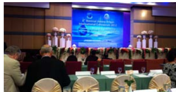
Conference centre in Chiang Mai, Thailand