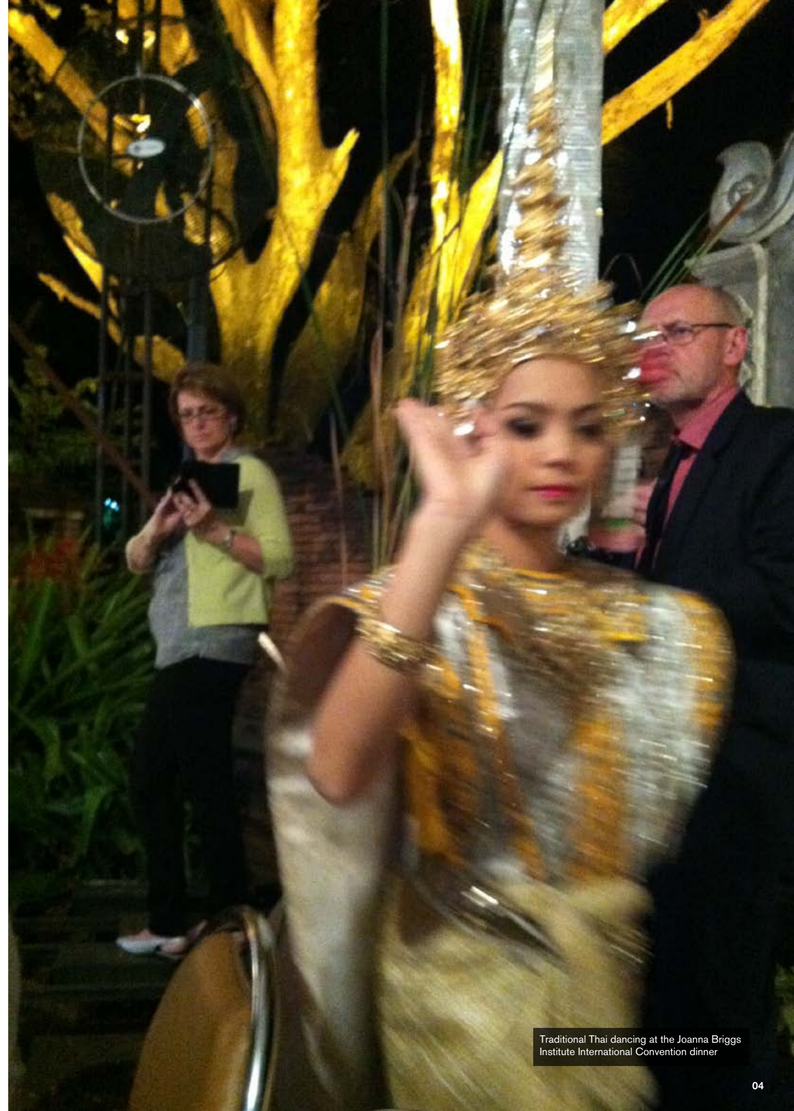
Traditional Thai dancing at the Joanna Briggs Institute International Convention dinner