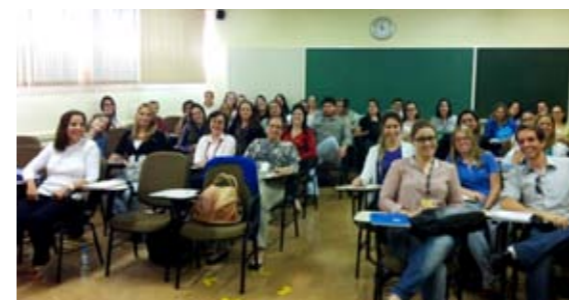
Workshops on 'framing the question' in Ribeirao Preto

The visit was a wonderful opportunity to strengthen our ties with the University of Sao Paulo. We are currently supporting and mentoring staff in the School of Nursing in Ribeirao Preto with two systematic reviews.