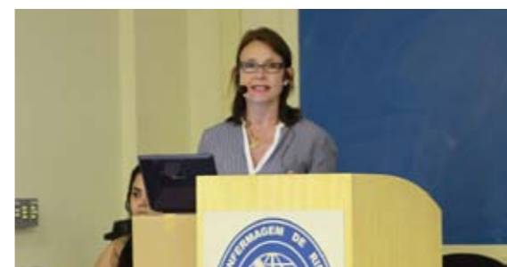
Lead lecture on Evidence Based Healthcare, Ribeirao Preto