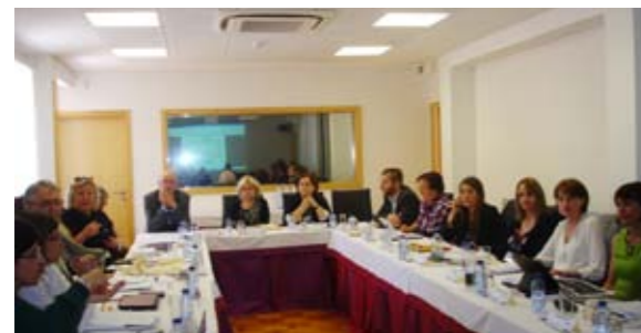
Second JBI European Group meeting in Coimbra

This year the JBI Colloquia is being held in Adelaide, South Australia (21-23 October). Three members of our JBI Centre will be giving oral presentations at this year's convention themed 'The 2013 campaign for getting evidence into policy'.