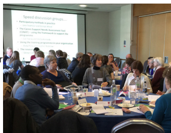
Discussion underway at the supporting carers workshop.