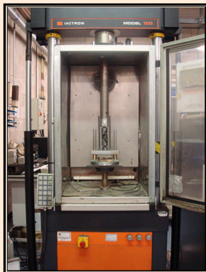
Instron servo hydraulic load frame for determination of adhesive and cohesive strength of asphalt mixtures

The majority of roads in the UK and throughout the world are constructed using asphalt mixtures with over 340 million tonnes being produced in Europe in 2007. The most important factor influencing the durability of asphalt mixtures is the presence of water in the pavement structure and the detrimental effect that water has on the properties of the mixtures. Moisture-induced damage is an extremely complicated mode of distress that leads to the loss of stiffness and structural strength of the asphalt and eventually to the costly failure of the road structure. An improved understanding of moisture-induced damage in asphalt and more moisture resistant materials could have a significant impact on road maintenance expenditure.