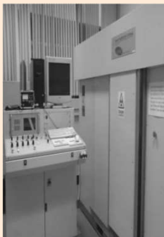
X-Ray Computer Tomography Set-up