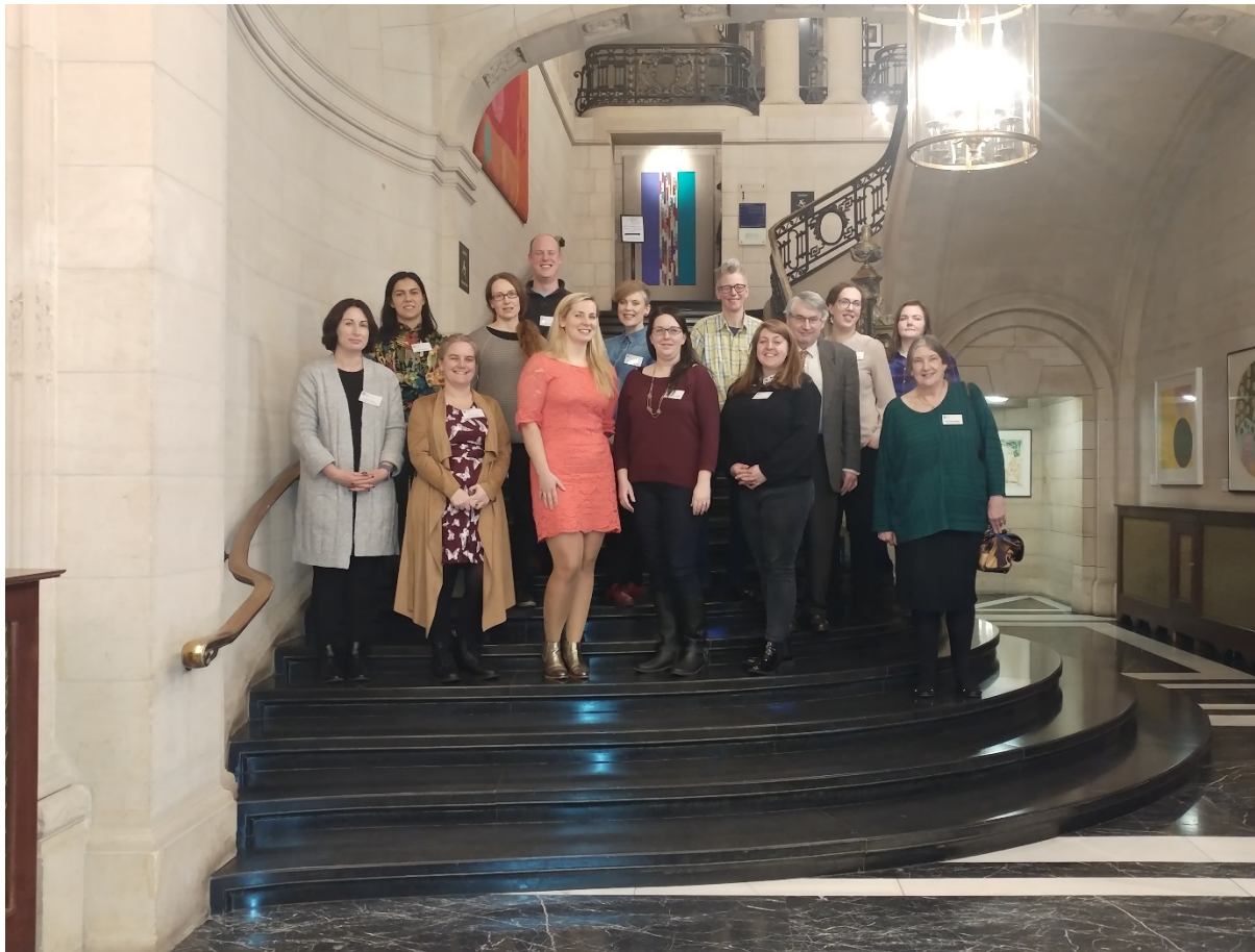
Steering group members at the end of day one