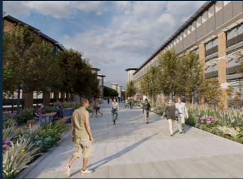
Proposed landscape view looking towards Central Building from Wilford Road

A series of artist illustrations for the site offer a first look of what the new campus may look like, revealing the modern architecture and state-of-the-art facilities that Castle Meadow will offer to students, businesses and the wider community.