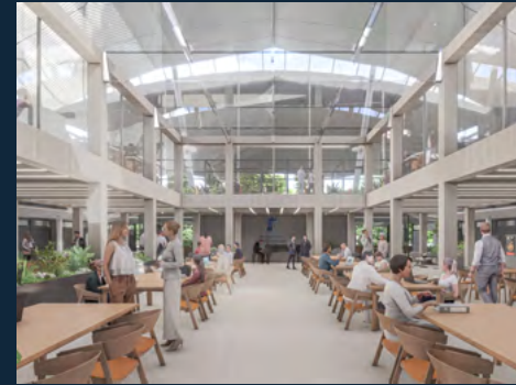
Proposed internal view of event and social space in Central Building

A key driver for the university is to ensure the campus aligns with our other welcoming and green campuses. Improvements to the two access points from Wilford Road and the canal towpath will be improved and enhanced. The university has appointed specialist consultants to review all aspects of the development to ensure each building and external space meets its vision of being 'ambitiously inclusive'.