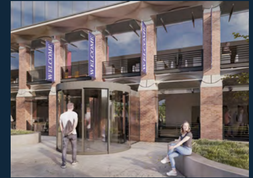
Proposed external view of blocks D & F

The university is undertaking renovations to the Central Building to enable it to become the hub of the campus for commercial and social activity. The building will have a new 'walkable roof' inserted into the main space to create a fully heated and ventilated event and social space for approximately 200 visitors. The roof will be accessible from the first floor to enable users of the building to have a winter garden to access, an unheated ambient space which will provide another great facility within the building. A bistro/cafe with associated kitchen facilities will be incorporated into the development, as well as social study spaces.