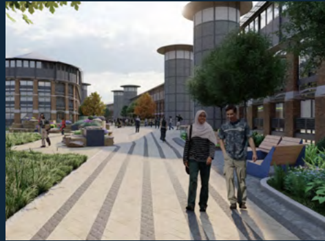
Proposed landscape view looking towards Central Building from canal towpath

Our aim is to provide extensive opportunities to re-green and open up spaces, making accessible and safe transport routes for staff, students, and visitors. With easy access to the train station and the cycle paths of the Nottingham Canal, the university will be promoting sustainable and green transport options. The campus has a sustainability strategy that will assess each development to ensure the university and Nottingham City meet their ambitious carbon-neutral targets. The campus is seen as an exemplar opportunity for how the city can retrofit existing buildings to create modern and sustainable facilities.