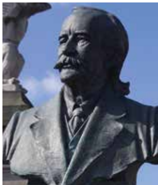
Jesse Boot donated Highfields.

The two-storey, five-bedroomed mansion house is little changed, although the porch was unfortunately replaced by a French window in 1928. The Lowe family would have spied grazing cattle