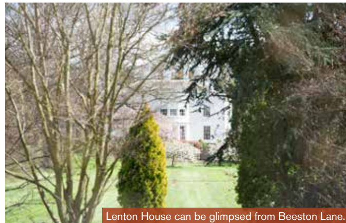
Lenton House can be glimpsed from Beeston Lane.