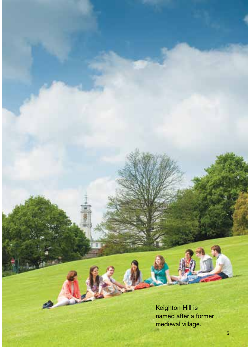
Keighton Hill is named after a former medieval village.

So began the residential development of the area shown as Lenton Park, as mapped by the Ordnance Survey in 1886.