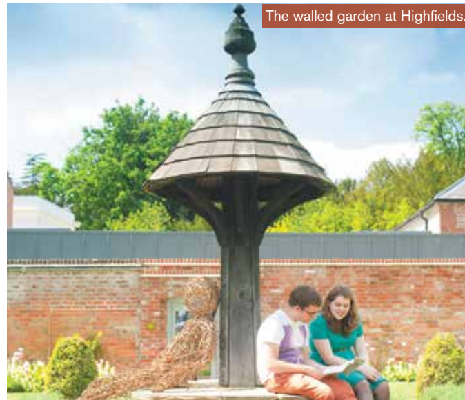
The walled garden at Highfields.

To the east side of the house is the walled garden. Edward Lowe, an astronomer, meteorologist and naturalist who lived at Highfields in the mid to late-19th century, filled the garden with vineries, stove houses and exotic ferns and plants.