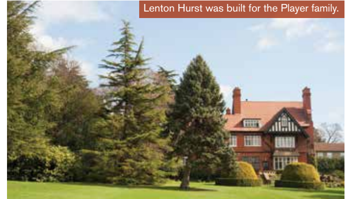
Lenton Hurst was built for the Player family.