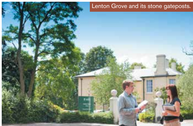
Lenton Grove and its stone gateposts.

At the west end of Beeston Lane is Lenton Grove, its entrance marked by two sturdy stone gateposts with large spherical finials.