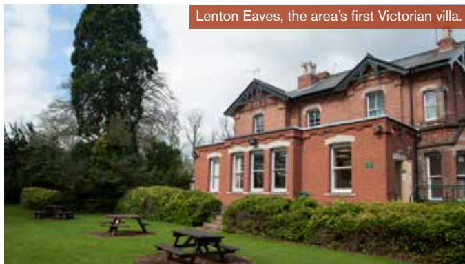
Lenton Eaves, the area's first Victorian villa.

Now the University Sports and Social Club, Lenton Eaves can be found where Beeston Lane bends to run parallel with Derby Road. Just after the bend a footpath marks the point where the two turnpikes joined.